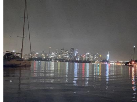
Sydney Harbour at 4:00am with no Ferry traffic

Next morning (Tuesday 31 December) everybody was checking the weather sites. The forecast was not great. A very strong cool change was expected early evening and would make it very uncomfortable staying in Athol Bay. South easterly winds up to 50 km per hour were expected. After much discussion it was decided that it would be best to head back to Rozelle Bay for New Year's Eve.