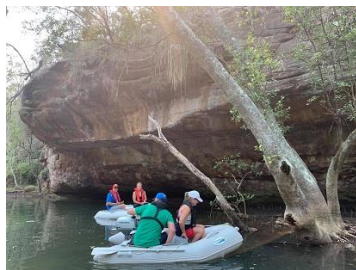
The Cave up, way up Sugarloaf creek