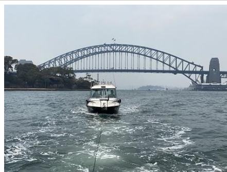
That's something you don't do every day, get towed under Sydney Harbour Bridge!

Seven boats, arrived in Tambourine Bay for the raft up and stay the night. Three from NSW & four from Victoria. It is a beautiful calm, sheltered bay where we could drop an anchor and stay the night. We couldn't get any sleep until the 11:00pm when the Sydney airport curfew kicked in as we were right under the flight path which did provide entertainment watching the planes appear out of the smoke on their landing approach.