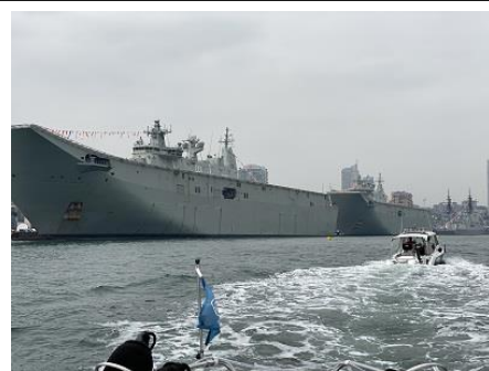
To the Point in Woolloomooloo Bay