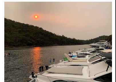
Smokie conditions in Sugarloaf Bay