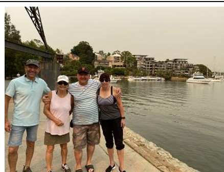
A walk to the fish market, the boats rafted in the background

Next morning (Sunday 29 December) we were up and went for a walk to the fish market which was just around in the next bay. The amount of seafood for sale was amazing. The fresh juices and chocolate coated fresh fruit was a hit with the walking team. On our way back we stopped for coffee at a lovely old house that has been converted to a café – thanks to local knowledge from Michael.