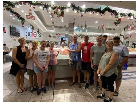
Sydney Fish Market

Back onboard our boats we decided it was time for a swim so we headed off under the Harbour Bridge to Clontarf Beach in Middle Harbour. It was a little rough in the harbour but all arrived safely and got the water toys out to play for the afternoon. Some enjoyed the luxury of an ice-cream from the ice-cream boat that was zipping in and out of the many boats that were out enjoying the hot weather. We headed further up Middle Harbour to raft up in Sugarloaf Bay for the evening. A beautiful location where the tenders came out and raced each other around the bay.