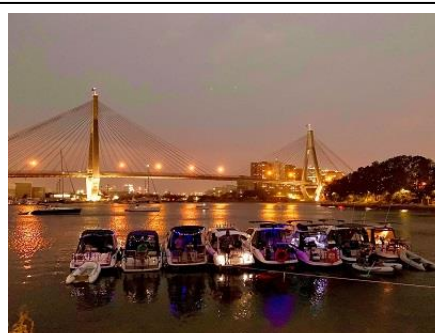
Rozelle Bay New Year's Eve Raft up with the ANZAC bridge.

We all returned to tenders and the boys ferried us all back to the boats where the party continued until we all returned to Bicentennial Park at 11:30pm to await the main show. Athena, Marie Christine, Imagine and Happy Dayze, all come to join the 8 Victorian boats in the Raft in Rozelle Bay after the 9:00pm fireworks display.