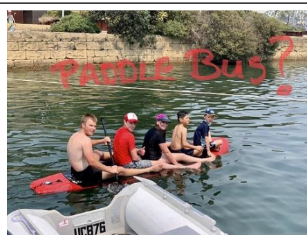
Rozelle Bay Public Transport!

Right on queue at 6:00pm, the wind changed from NE to SE and increased to over 50km/hour. We were very pleased with our decision to leave Athol Bay and raft up in the calm of Rozelle Bay, very