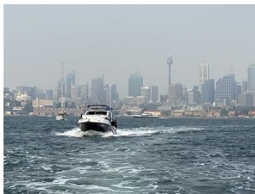
"The Boss" on a choppy Sydney Harbour

Back onboard our boats we decided it was time for a swim so we headed off under the Harbour Bridge to Clontarf Beach in Middle Harbour. It was a little rough in the harbour but all arrived safely and got the water toys out to play for the afternoon. Some enjoyed the luxury of an ice-cream from the ice-cream boat that was zipping in and out of the many boats that were out enjoying the hot weather. We headed further up Middle Harbour to raft up in Sugarloaf Bay for the evening. A beautiful location where the tenders came out and raced each other around the bay.