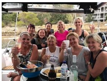
Happy hour Rozelle Bay New Years Eve

protected from the southerly wind. Everybody got into the spirit of NYE and with an extended happy hour across 3 or 4 of the boats in the middle of the 8 boat raft up.