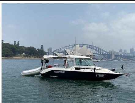
Farm Cove and "To the Point" just won't go any further! Not a bad spot to stop and enjoy the view!