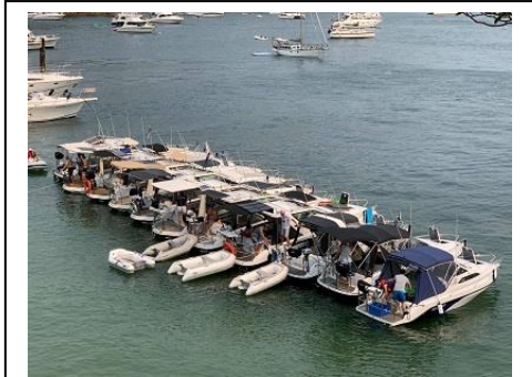
Athol Bay below Taronga Zoo

After a leisurely morning we headed back to Clontarf Beach for more fun time in the water and then around to Athol Bay to join more of the NSW Whittley Club for the evening. We rafted up just off the beach near Taronga Zoo which had spectacular views looking back over the water to the Opera House, CBD and Harbour Bridge. It was a bit lumpy to start with due to the boat traffic on the Harbour but settled down after 8 pm. It was lovely to lie in your boat and listen to the animals in the zoo.