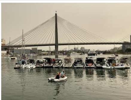
Rozelle Bay & the ANZAC Bridge

On the 27/12/2019, Lucky Us, headed off along the Princes Highway via Bruthen, Cann River, Bombala to stay at a very smoky Canberra for the night. Two crews were already in Sydney, and the rest were travelling up the Hume Highway. We were up early the next morning to head to Nowra where we had left our boat in storage after the Port Stephens cruise in November. We had a very scenic drive down the Kangaroo Valley road to Nowra. Restocked the boat and left Nowra at midday to head for Sydney. Arrived at the Wharf Road boat ramp to find Craig and Cody getting “Sea Ya” ready to launch. They were off to pick up the rest of the family who had flown over from Hobart. We also met David with “DFJT”. We headed down the Parramatta River to join the others who were rafted for the evening in Rozelle Bay (just under the Anzac Bridge). We arrived to find the Victorian Crews - Siennabelle (Mario & Fil), See ya (Craig, Alanna, Cody, Tahlia, Zac), To The Point (Dean, Tracey, Bryce), The Boss (Renato & Dom), Casper (Peter & Gail), Our Time (Russell & Deb) with the NSW crews Athena (Roger & Athena), Marie Christine (Michael), Tranquillite (Bruce & Sharon).