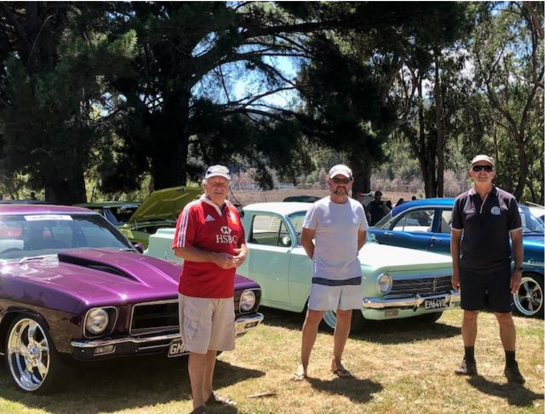
Jamieson Brewery car show.

Impulse decided to stay over another night, so the remaining three boats slowly back tracked around the submerged trees and heading back to Bonnie Doon but not before a beautiful swim in 60 metres of water outside the boat club at Jerusalem Creek.