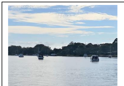
Figure 2 McMillan Strait