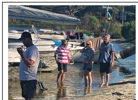
Figure 11 - Duck Arm Monday Morning