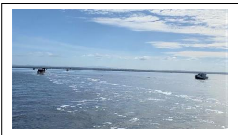
Figure 1 - Lake King

At 10 am on a blue-sky Saturday morning, 9 boats headed off to Metung to pick up 3 more boats on our way to Lakes Entrance. Marisca had organised bar crossing training for interested crews to attend. We moored on the Flagstaff Jetty just opposite the Gippsland TAFE in Cunninghame Arm, Lakes Entrance. Wilco & Marisca went across to pick up Brad Lancaster, the local expert on the Lakes Entrance Bar. Brad decided it would be good to do the training at the lookout overlooking the Bar.