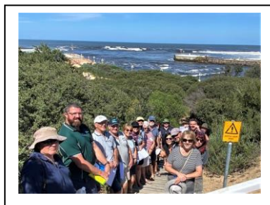
Figure 5 - Lakes Entrance Bar