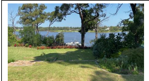
Figure 10 - Boats on Scott & Davini's private Jetty

Scott & Davini invited all crews to come over for Sunday lunch at their new house situated along the picturesque Newlands Arm in Paynesville. As there was not much jetty space, we all squeezed onto 4 boats for the short trip from Duck Arm. We were able to relax and enjoy the wonderful view of the lake from their backyard while Davini cooked up some delicious curries and rice for lunch. A big thanks to Scott & Davini for welcoming us into their new home. We headed back to Duck Arm for happy hour and a light dinner. I think most of us still had full stomachs from lunch!