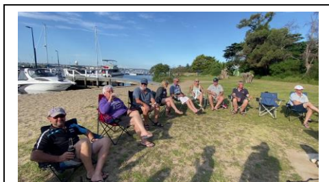
Figure 8 - Saturday Happy Hour

After the Bar Crossing training we decided to stay at Flagstaff Jetty where some crews relaxed on the beach, others on the water, some went over to Lakes Entrance whilst others went in search of fresh prawns. Happy hour was held on the lawn at the end of the jetty where there was plenty of room to make a huge circle and welcome new Club members and catch up with familiar faces that some of us hadn't seen for over 2 years.