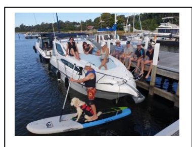
Figure 4- Flagstaff Jetty