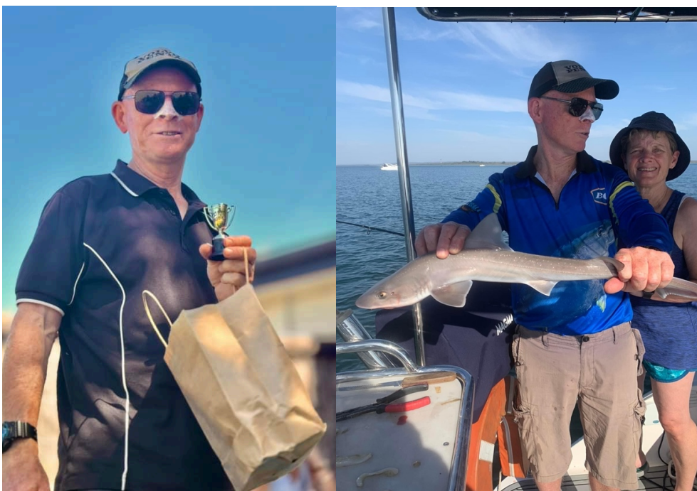
Biggest fish: Leeway