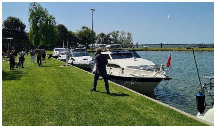
The Whittley Club, Docked at the Yarrawonga Ski Club