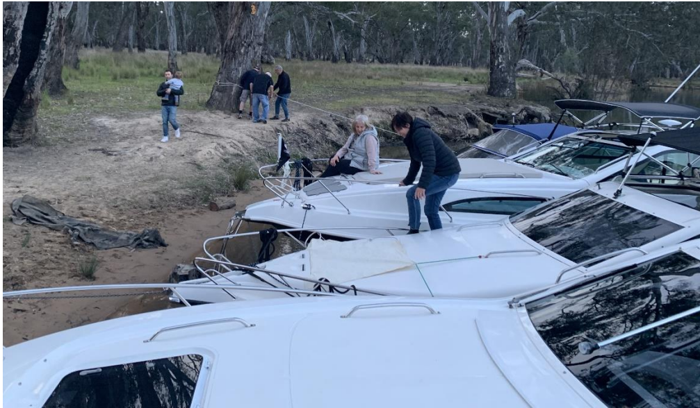
Parked for the night on the Murray River, The boys are making things secure.

We all had dinner and some snacks. And a glass of wine, or two.