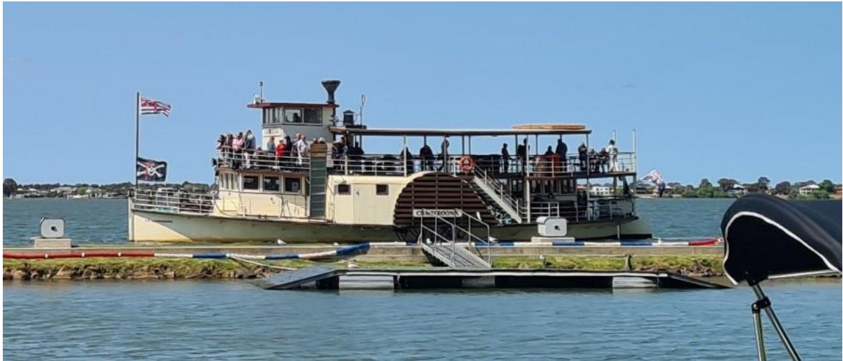
Murray river Paddle steamer. P.S Cumberoona