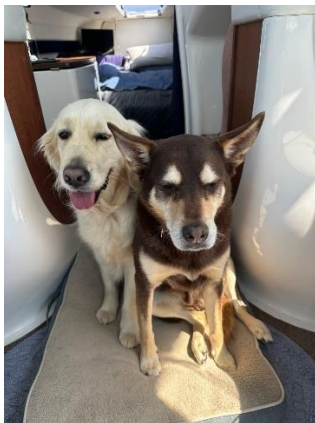
Crew members ready to help.

Time to settle in and have a restful sleepover in our floating caravans, a beautiful calm and restful night.