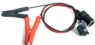
BA-550 Adapter Kit Alligator Clips