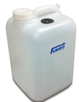
BA-554 Tank for Mini Pump