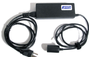
BA-551 Adapter Kit 110V Wall Plug