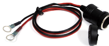
BA-553 Adapter Kit Ring Terminals