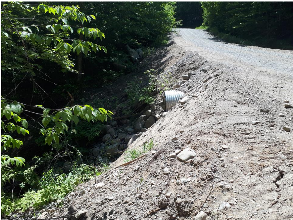
Figure 2, Water crossing repaired by a third party, note the steep banks and unstable slopes that come from using a short pipe. 46.99028, -84.33972

Mile 38 Road is a primary access road on the forest. During the audit it was observed that on a portion of the road (approx. from km 10 to km 24) that recent road work had been undertaken including road grading and water crossing replacement. The results were that large false ditches have been established on the road (which will trap and funnel water). Two of the water crossing were extremely poorly installed: banks were too steep and unstable, culverts were too short and possibly too small for the water flow. The result was that banks were eroding into the creeks they were mean to protect.