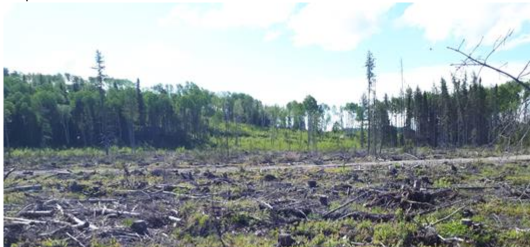
Figure 1. Clear cut harvest with residual trees, patches and peninsulas.

Forest operations prescriptions are made by a professional forester. Prescriptions for all harvesting include specifications for residual standing trees including a species priority list. Habitat features such as calving areas, mineral licks, and dens must be protected. All partial cuts were marked by certified technicians and operators were in full compliance with the prescriptions. All clearcut harvest are designed to emulate fire by leaving peninsulas and interior patches along with residual standing trees and clumps.