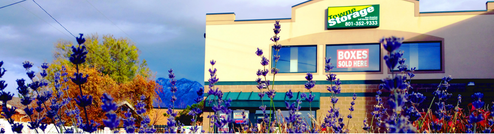
Towne Storage Union Park (Salt Lake City, UT)