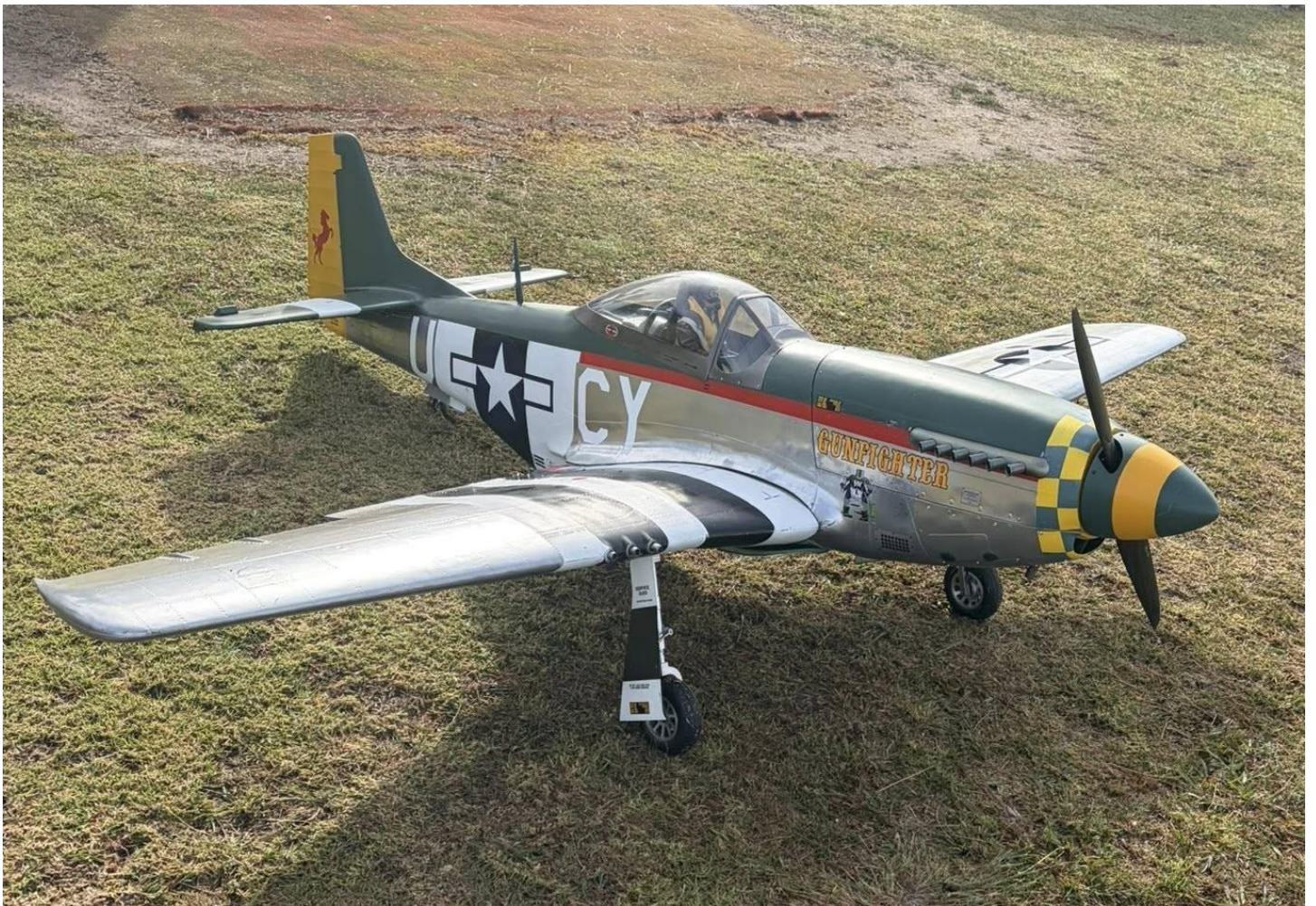
Above & below pics from the Bairnsdale MMM, taken from the LVMAC facebook Page