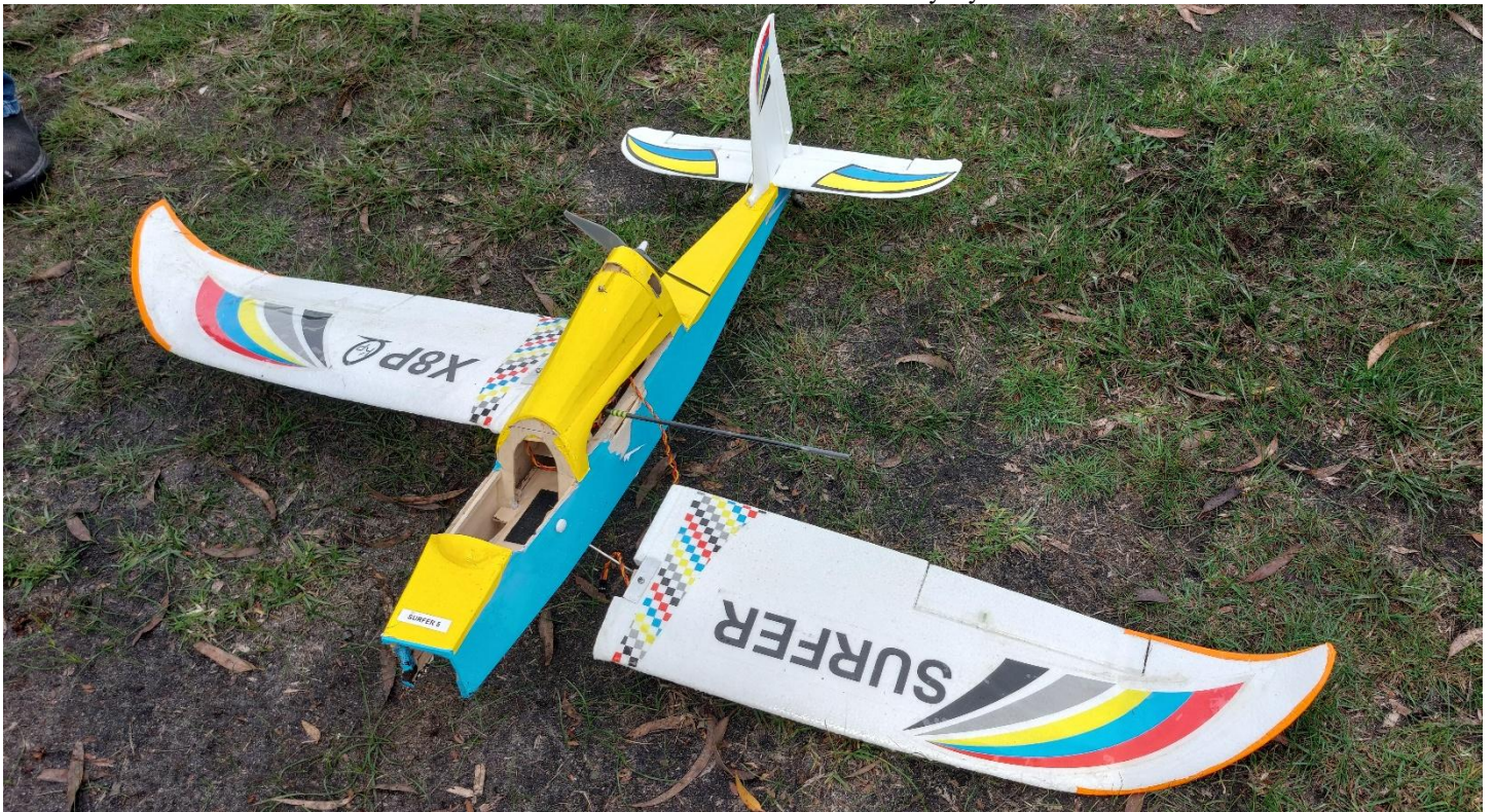
Above - Ivan’s Surfer bit the dust- It had a small motor in the front and the bigger one pushing from the back

Combat Classic Event - The Combat Part of the Combat Cup was Round 2 of the Combat Classic Event. Due to the weather and other extenuating factors, Event 1 of the Combat Classic has not yet been run but Event 2 results are: