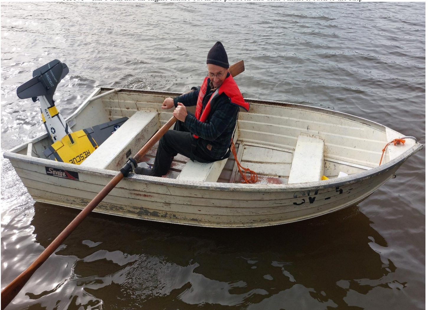
Above – Godwin’s Albatross crashed in the Lake – he thinks the battery moved back and the model became tail heavy