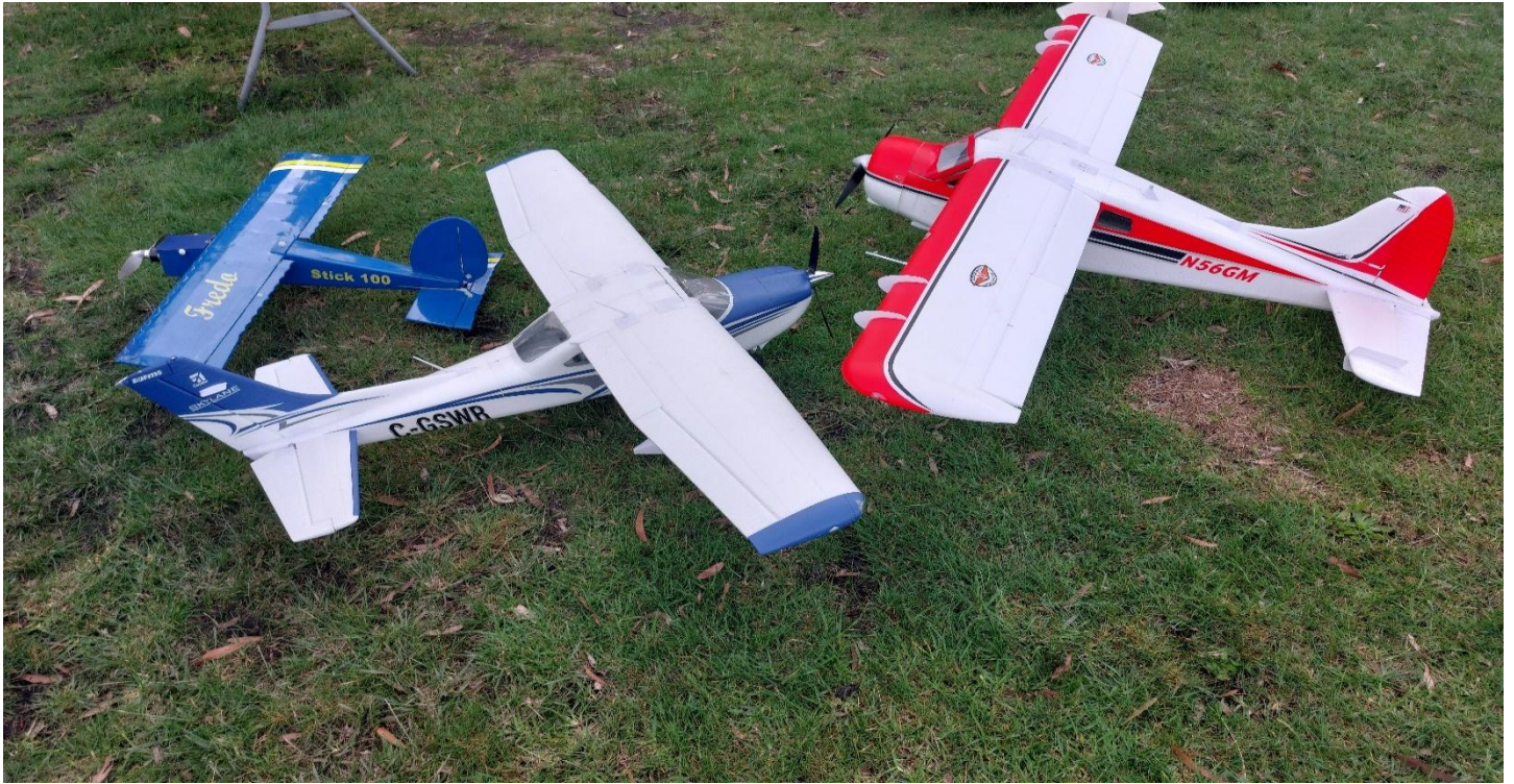
Above – Graham’s collection for the flyday