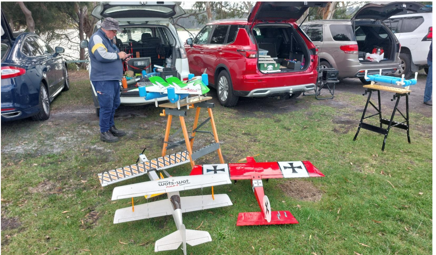
Above – Lofty's collection for the flyday

A few of the members left early to go to Mothers Day Lunches and there were also a few visitors showing some interest in the proceedings of the day.