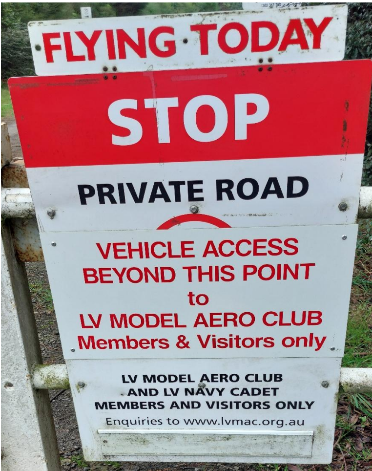
Left – the new gate signage

Many thanks to those who have contributed to the newsletter with Articles, Pictures and information this month. It would be good to get some new contributors. Thanks also to our regular contributors in particular for their monthly contributions.