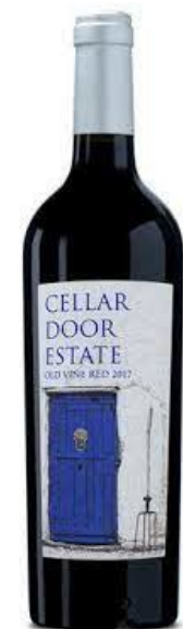
Cellar Door Old Vine Red

Another wine from southern Portugal, the Sericaia red is a deep purple color with a backbone of tangy, firm tannins and concentrated flavors of black plums, blueberries, lemon pith and sweet oak.