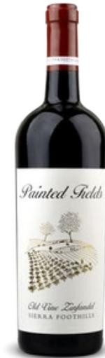
Old Vines Zinfandel

A perfectly balanced Bordeaux blend with an intense ruby color and aromas of dried violet, black cherry, fresh herbs and cocoa powder. Velvety tannins and a lingering finish of dark berries and black licorice round out this award winner.