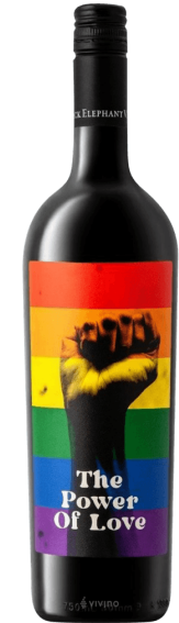
The Power of Love

The nose reveals plenty of cherry and grenadine aromas with a touch of herbs. Nice acidity and moderate tannins hold fresh fruit and grass flavors. It has a medium finish with subtle berry notes.