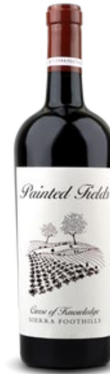
Curse of Knowledge

Aromas of lemon blossom, with ripe citrus flavors and a hint of fresh-cut green apples. Medium-bodied with refreshing acidity and a lively and vibrant mouthfeel.