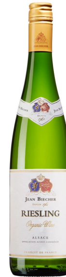
Jean Biecher Riesling

A deep straw yellow color characterizes this organic pinot grigio. The nose is rich in aromas of soft peaches and green apple with a hint of acacia flowers. The palate has a bright freshness and clean minerality.