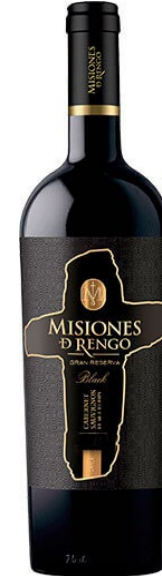
Misiones D Rengo Black

Cherry and licorice with hints of toasted oak shape the nose of this blend. This is a full-bodied wine with chewy tannins and good acidity. It has concentrated tart cherry and red plum with hints of blackberry jam.