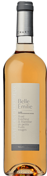
Cuvee Bacchus Rose

Fresh and fruity rosé wine made from grenache and cinsault grapes. Notes of black currant, raspberry, strawberry in the bouquet. Fruity, delicious on the palate, with aromas of red berries. To serve around 10-13°C