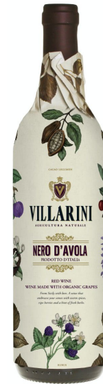
Villarini Nero d'Avola

This wine comes from vineyards that belong to the heart of Tuscany, between Florence and Siena. Made from 80% Sangiovese and 20% Colorino and Malvasia grapes, it shows an intense ruby red, with notes of cherry, plum, black pepper. Intense and smooth