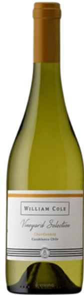
Wm Cole Chardonnay

On the nose, the predominant notes are white peach and a little honey. Its persistence is medium and its body is light with a lot of freshness. It presents with juicy acidity and mineral and fruity notes.