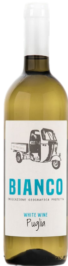
Linea Italy Bianco

A Puglian white wine made from Verdeca grapes, this wine has a straw yellow color with pale green highlights. Aromas of grass, tropical fruits and citrus. Balanced and savory with a hint of green apple and minerality, this fresh, young versatile wine is often compared with Portuguese Alvarinho and Vino Verde.