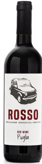
Linea Italy Rosso

A Puglian white wine made from Verdeca grapes, this wine has a straw yellow color with pale green highlights. Aromas of grass, tropical fruits and citrus. Balanced and savory with a hint of green apple and minerality, this fresh, young versatile wine is often compared with Portuguese Alvarinho and Vino Verde.