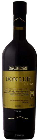
Don Luis Terra

*GREAT WINES, GREAT DEALS (LESS THAN 2 CASES IN STOCK)*