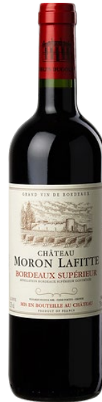
Chateau Moron Lafitte

Fresh and fruity wine made with 60% Grenache, 20% Syrah, and 20% Mourvèdre grapes. Perfect for friendly times with a palate full of red crunchy fruits. Fine wine, very “gouleyant” and pleasurable. From Chateau Fonsalade in Languedoc.