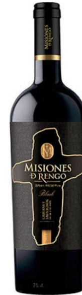
Misiones D Rengo Black

The wine is ruby red in the glass and has aromas of red fruits, wild berries and gentle spice. On the palate it is elegant and delicate with vibrant dark berry flavors, white pepper and Asian spices. It is bursting with sweet red fruit flavors that are round and juicy. A 100% natural GSM.