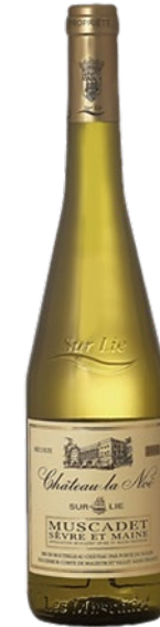
Chateau La Noe Muscadet

Aged on lees, this Muscadet Sèvre-et-Maine sur Lie from Château La Noë offers complexity and depth with a refreshing finish. Floral, refreshing, balanced and fruit forward, with a gentle bitterness and hints of lemon and hazelnuts.