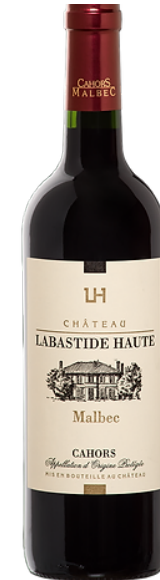
Chateau Labastide Haute