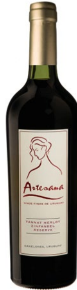
Artesana T-M-Z Blend

On the nose, the predominant notes are white peach and a little honey. Its persistence is medium and its body is light with a lot of freshness. It presents with juicy acidity and mineral and fruity notes.