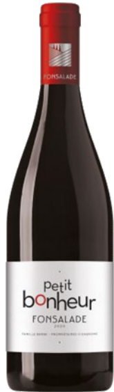
Petit Bonheur GSM

Fresh and fruity wine made with 60% Grenache, 20% Syrah, and 20% Mourvèdre grapes. Perfect for friendly times with a palate full of red crunchy fruits. Fine wine, very “gouleyant” and pleasurable. From Chateau Fonsalade in Languedoc.