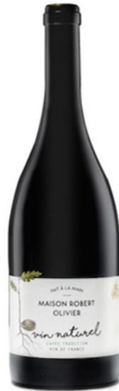
Maison Robert Olivier

Intense aroma of blackberries and cassis with notes of vanilla, chocolate, caramel and roasted aromas. A rich, complex blend of ripe red and black fruits layered with spice, hints of tobacco, wood and leather. Velvety on the palate. Cabernet Sauvignon, Merlot, Petit Verdot, and Malbec.