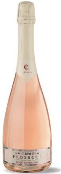
La Ceriola Rose

A sparkling Rose of Pinot Noir from Serra Gaucha, Brazil. Light cherry color with small perlage. Notes of strawberry and blackberry with a touch of citrus. Structured and creamy with refreshing acidity.