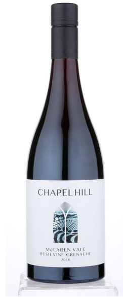
Bush Vine Grenache

Old, low yielding vines result in small berries, thick skins and open bunches which deliver bright fruit flavors and a rustic savory texture. Notes of cherry and cranberry juice combine with florals, pepper and earthy spice.