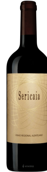
Sericaia Regional Red

From the Alentejo region in southern Portugal, this fresh, silky white has clean flavors of lime sorbet, pear, mango and tropical fruits and a touch of salinity.