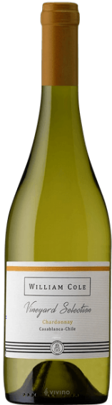
Wm Cole Chardonnay

On the nose, the predominant notes are white peach and a little honey. Its persistence is medium and its body is light with a lot of freshness. It presents with juicy acidity and mineral and fruity notes.