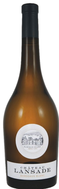
Chateau Lansade Bordeaux Blanc

This softly textured white wine comes from the Icard family holdings in central Entre-deux-Mers France, some which they have owned for centuries. The taste suggests tropical fruits, with tangy acidity to keep everything fresh.