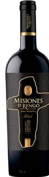
Misiones D Rengo Black

Cherry and licorice with hints of toasted oak shape the nose of this blend. This is a full-bodied wine with chewy tannins and good acidity. It has concentrated tart cherry and red plum with hints of blackberry jam.