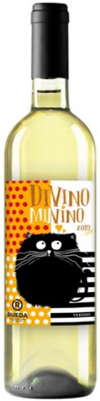
Divino Minino Verdejo

Aromas of Bartlett pear and lemon zest with a complex palate offering flavors of grapefruit, lemon-lime, freesia and high acidity. It is refreshing in the mouth and offers a splash of orange on the finish.