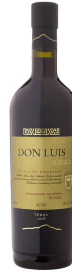
Don Luis Terra

A gem from Mexico! 100% Viognier with a pale gold color, excellent brightness, green and tropical fruit aromas and a floral touch. Unique and long on the palate, with firm acidity and excellent balance.