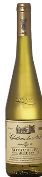
Chateau La Noe Muscadet

Fresh and fruity rosé wine made from grenache and cinsault grapes. Notes of black currant, raspberry, strawberry in the bouquet. Fruity, delicious on the palate, with aromas of red berries. Best chilled to 50-55°F.