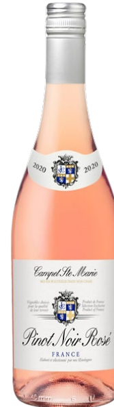
Rose of Pinot Noir

Lovely aromas of ripe pear and quince, followed by elegant hints of vanilla. A rich and full-flavored palate of pear and cream. Enjoy this wine slightly chilled, with white meat and mushroom sauce, pasta carbonara and clam chowder.