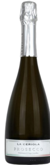
La Ceriola Extra Dry

An extra dry Prosecco combining Glera and Pinot Nero grapes. Enjoy a fruity bouquet of honey, berries and citrus. Well-balanced acidity with refreshing notes of red berries and grapefruit with a fine perlage.