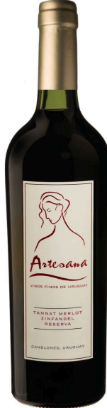
Artesana T-M-Z Blend

On the nose, the predominant notes are white peach and a little honey. Its persistence is medium and its body is light with a lot of freshness. It presents with juicy acidity and mineral and fruity notes.