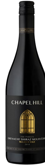
The Parson GSM

Old, low yielding vines result in small berries, thick skins and open bunches which deliver bright fruit flavors and a rustic savory texture. Notes of cherry and cranberry juice combine with florals, pepper and earthy spice.