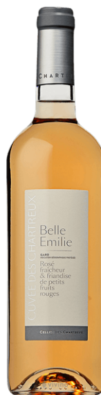
Cuvee Bacchus Rose

This softly textured white wine comes from the Icard family holdings in central Entre-deux-Mers France, some which they have owned for centuries. The taste suggests tropical fruits, with tangy acidity to keep everything fresh.