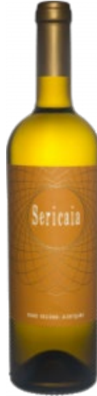
Sericaia Regional White

Aromas of Bartlett pear and lemon zest with a complex palate offering flavors of grapefruit, lemon-lime, freesia and high acidity. It is refreshing in the mouth and offers a splash of orange on the finish.