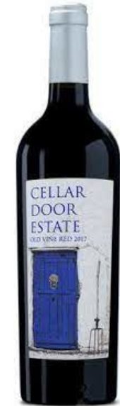
Cellar Door Old Vine Red

Another wine from southern Portugal, the Sericaia red is a deep purple color with a backbone of tangy, firm tannins and concentrated flavors of black plums, blueberries, lemon pith and sweet oak.