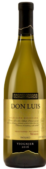
Don Luis Viognier

A gem from Mexico! 100% Viognier with a pale gold color, excellent brightness, green and tropical fruit aromas and a floral touch. Unique and long on the palate, with firm acidity and excellent balance.