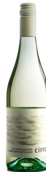
Cirro Sauvignon Blanc

Aged on lees, this Muscadet Sèvre-et-Maine sur Lie from Château La Noë offers complexity and depth with a refreshing finish. Floral, refreshing, balanced and fruit forward, with a gentle bitterness and hints of lemon and hazelnuts.