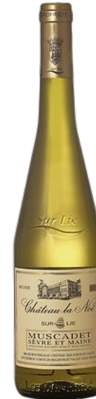
Chateau La Noe Muscadet

Fresh and fruity rosé wine made from grenache and cinsault grapes. Notes of black currant, raspberry, strawberry in the bouquet. Fruity, delicious on the palate, with aromas of red berries. Best chilled to 50-55°F.