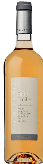
Cuvee Bacchus Rose

This softly textured white wine comes from the Icard family holdings in central Entre-deux-Mers France, some which they have owned for centuries. The taste suggests tropical fruits, with tangy acidity to keep everything fresh.