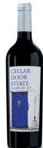
Cellar Door Old Vine Red

Another wine from southern Portugal, the Sericaia red is a deep purple color with a backbone of tangy, firm tannins and concentrated flavors of black plums, blueberries, lemon pith and sweet oak.