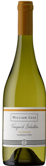
Wm Cole Chardonnay

On the nose, the predominant notes are white peach and a little honey. Its persistence is medium and its body is light with a lot of freshness. It presents with juicy acidity and mineral and fruity notes.