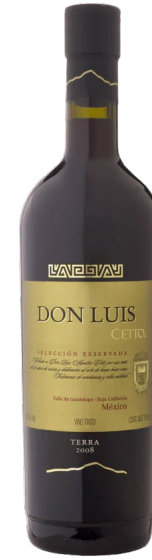
Don Luis Terra

A gem from Mexico! 100% Viognier with a pale gold color, excellent brightness, green and tropical fruit aromas and a floral touch. Unique and long on the palate, with firm acidity and excellent balance.