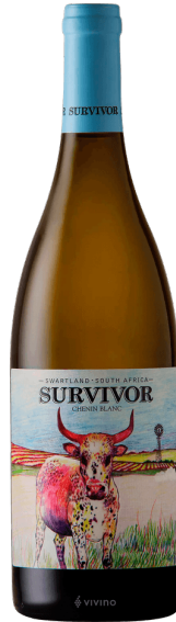
Survivor Chenin Blanc

This wine has an electric pink glow, a nose of fresh herbs de Provence, watermelon and orange zest and lovely acidity. Flavors of raspberry, cranberry and watermelon all unified by a slate like minerality.