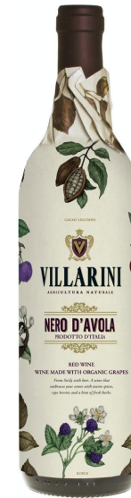
Villarini Nero d'Avola

This wine comes from vineyards that belong to the heart of Tuscany, between Florence and Siena. Made from 80% Sangiovese and 20% Colorino and Malvasia grapes, it shows an intense ruby red, with notes of cherry, plum, black pepper. Intense and smooth