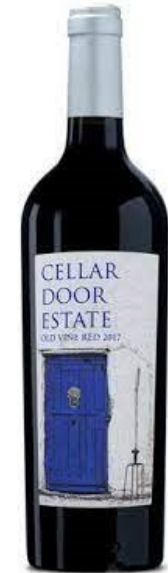
Cellar Door Old Vine Red

Another wine from southern Portugal, the Sericaia red is a deep purple color with a backbone of tangy, firm tannins and concentrated flavors of black plums, blueberries, lemon pith and sweet oak.