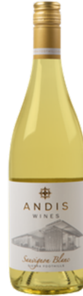
Andis Sauvignon Blanc

This softly textured white wine comes from the Icard family holdings in central Entre-deux-Mers, some which they have owned for centuries. The taste suggests tropical fruits, with tangy acidity to keep everything fresh.