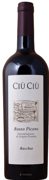
Ciu Ciu Bacchus Piceno

There's so much to love in this big and bold Montepulciano and Sangiovese blend grown on Marche's hills. Cherry, deep dark fruit and some chewy, nutty tannins give this plenty of intrigue. Dry, medium-bodied and harmonious, this one's a crowd pleaser. Unoaked.