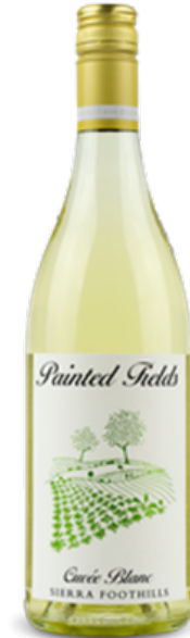
Andis Cuvee Blanc

Aromas of lemon blossom, with ripe citrus flavors and a hint of fresh-cut green apples. Medium-bodied with refreshing acidity and a lively and vibrant mouthfeel.