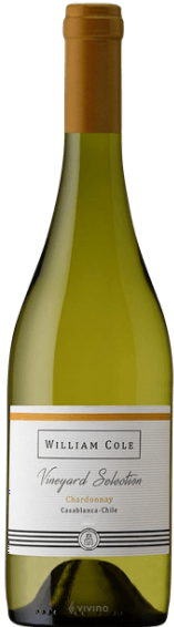
Wm Cole Chardonnay

On the nose, the predominant notes are white peach and a little honey. Its persistence is medium and its body is light with a lot of freshness. It presents with juicy acidity and mineral and fruity notes.