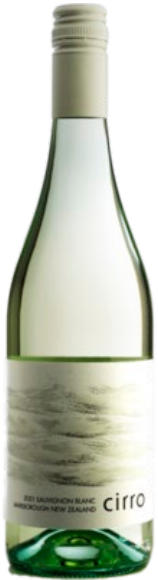
Cirro Sauvignon Blanc

Pale straw color, translucent green hues and platinum reflections throughout. The palate has racy tones of kaffir lime peel, yellow grapefruit peel, passionfruit, and lemongrass. Notes of freshly picked cilantro intermingle with wet river stones, polished steel, and citrus peel.