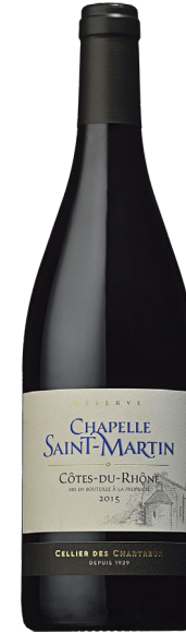
Chapelle Saint Martin

A blend of Grenache and Syrah with a clear red color. The nose is complex and deep. The red fruits mingle with flower notes, violet and end up with a fresh note of pepper. The round mouth is finished on well-blended tannins.