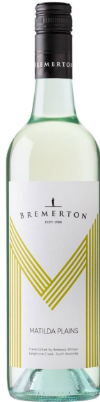
Matilda Plains White Blend

The cool evenings of the Langhorne Creek region gives this zesty blend of Sauvignon Blanc and Verdelho a natural acidity and finesse. Aromas and a subtle palate of ripe lemon, peach and papaya notes characterize this crisp, refreshing wine. 87 Points, Wine Enthusiast