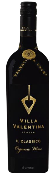
Viva Valentina Il Classico

A premium organic wine that boasts a range of classic Italian aromas, including cherry, blackberry, and plum, with subtle hints of herb and sage. From the famed Sicilian Botter Family, aging for 10 months in new and old oak barrels gives it a touch of leather and vanilla,