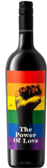
The Power of Love

The nose reveals plenty of cherry and grenadine aromas with a touch of herbs. Nice acidity and moderate tannins hold fresh fruit and grass flavors. It has a medium finish with subtle berry notes.