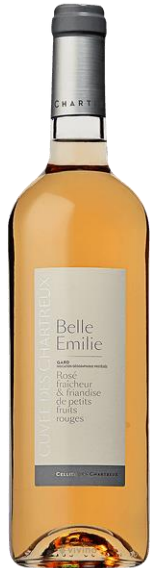
Cuvee Bacchus Rose

Fresh and fruity rosé wine made from grenache and cinsault grapes. Notes of black currant, raspberry, strawberry in the bouquet. Fruity, delicious on the palate, with aromas of red berries. To serve around 10-13°C