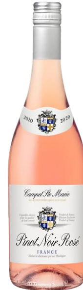
Rose of Pinot Noir

Lovely aromas of ripe pear and quince, followed by elegant hints of vanilla. A rich and full-flavored palate of pear and cream. Enjoy this wine slightly chilled, with white meat and mushroom sauce, pasta carbonara and clam chowder.