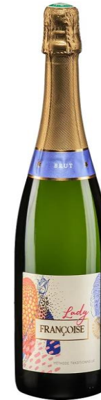
Lady Françoise Brut

A drier style of bubbly, with lingering flavors of tropical fruit, green fig, lime, pear and a light note of butter. Creamy, fresh and well-balanced. 100% Sauvignon Blanc from the Western Cape of South Africa.