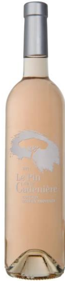
Le Pin de Cadeniere

This amber vermentinu will surprise you with its pronounced tannins, unique freshness and brilliant orange color. A surprising bouquet on the nose and in the mouth with candied fruit (apricot and orange) aromas and a marked tannic presence. Full and round on the palate.