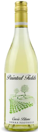
Andis Cuvee Blanc

Pale straw color, translucent green hues and platinum reflections throughout. The palate has racy tones of kaffir lime peel, yellow grapefruit peel, passionfruit, and lemongrass. Notes of freshly picked cilantro intermingle with wet river stones, polished steel, and citrus peel.