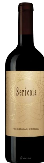
Sericaia Regional Red

From the Alentejo region in southern Portugal, this fresh, silky white has clean flavors of lime sorbet, pear, mango and tropical fruits and a touch of salinity.