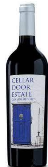
Cellar Door Old Vine Red

Another wine from southern Portugal, the Sericaia red is a deep purple color with a backbone of tangy, firm tannins and concentrated flavors of black plums, blueberries, lemon pith and sweet oak.