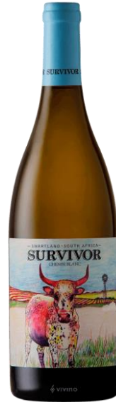
Survivor Chenin Blanc

This wine has an electric pink glow, a nose of fresh herbs de Provence, watermelon and orange zest and lovely acidity. Flavors of raspberry, cranberry and watermelon all unified by a slate like minerality.