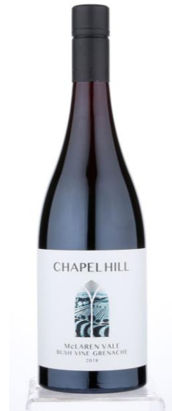
Bush Vine Grenache

Old, low yielding vines result in small berries, thick skins and open bunches which deliver bright fruit flavors and a rustic savory texture. Notes of cherry and cranberry juice combine with florals, pepper and earthy spice.