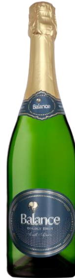
Balance Boldy Brut

Light cherry color with small perlage. Notes of strawberry and blackberry with a touch of citrus. Structured and creamy with refreshing acidity.