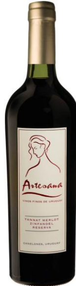
Artesana T-M-Z Blend

On the nose, the predominant notes are white peach and a little honey. Its persistence is medium and its body is light with a lot of freshness. It presents with juicy acidity and mineral and fruity notes.