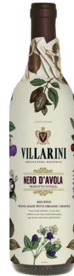
Villarini Nero d'Avola

This wine comes from vineyards that belong to the heart of Tuscany, between Florence and Siena. Made from 80% Sangiovese and 20% Colorino and Malvasia grapes, it shows an intense ruby red, with notes of cherry, plum, black pepper. Intense and smooth