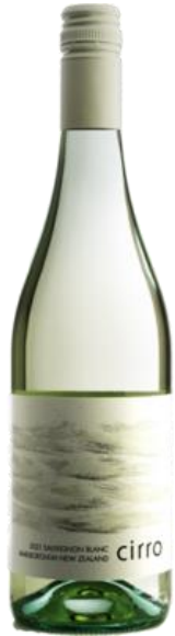
Cirro Sauvignon Blanc

Pale straw color, translucent green hues and platinum reflections throughout. The palate has racy tones of kaffir lime peel, yellow grapefruit peel, passionfruit, and lemongrass. Notes of freshly picked cilantro intermingle with wet river stones, polished steel, and citrus peel.