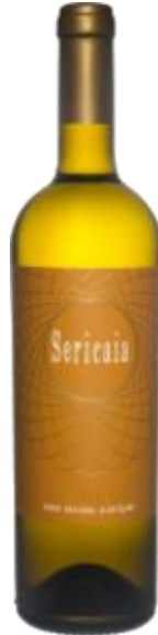
Sericaia Regional White

Aromas of Bartlett pear and lemon zest with a complex palate offering flavors of grapefruit, lemon-lime, freesia and high acidity. It is refreshing in the mouth and offers a splash of orange on the finish.