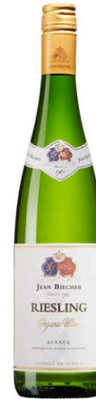
Jean Biecher Riesling

A deep straw yellow color characterizes this organic pinot grigio. The nose is rich in aromas of soft peaches and green apple with a hint of acacia flowers. The palate has a bright freshness and clean minerality.