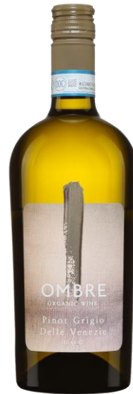
Ombre Pinot Grigio

Delicate perlage and bouquet apple and pear with secondary notes of acacia and lilac. Fresh and light on the palate, balanced acidity and body. 100% Glera., DOC Veneto.