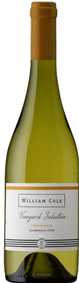
Wm Cole Chardonnay

On the nose, the predominant notes are white peach and a little honey. Its persistence is medium and its body is light with a lot of freshness. It presents with juicy acidity and mineral and fruity notes.