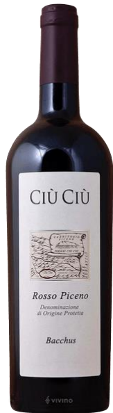
Ciu Ciu Bacchus Piceno

There's so much to love in this big and bold Montepulciano and Sangiovese blend grown on Marche's hills. Cherry, deep dark fruit and some chewy, nutty tannins give this plenty of intrigue. Dry, medium-bodied and harmonious, this one's a crowd pleaser. Unoaked.