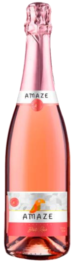
Amaze Rose Pinot Noir

Light cherry color with small perlage. Notes of strawberry and blackberry with a touch of citrus. Structured and creamy with refreshing acidity.