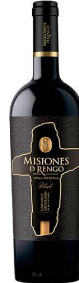
Misiones D Rengo Black

Cherry and licorice with hints of toasted oak shape the nose of this blend. This is a full-bodied wine with chewy tannins and good acidity. It has concentrated tart cherry and red plum with hints of blackberry jam.