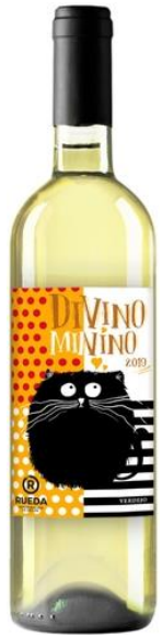
Divino Minino Verdejo

Aromas of Bartlett pear and lemon zest with a complex palate offering flavors of grapefruit, lemon-lime, freesia and high acidity. It is refreshing in the mouth and offers a splash of orange on the finish.