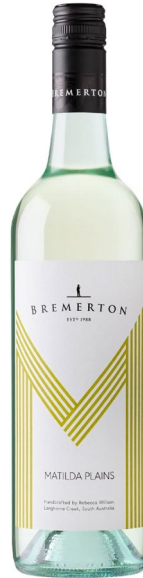
Matilda Plains White Blend

The cool evenings of the Langhorne Creek region gives this zesty blend of Sauvignon Blanc and Verdelho a natural acidity and finesse. Aromas and a subtle palate of ripe lemon, peach and papaya notes characterize this crisp, refreshing wine. 87 Points, Wine Enthusiast