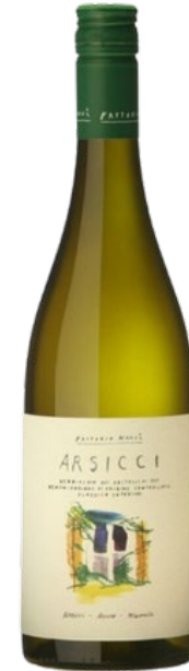
Fattoria Nanni Arsicci

Pale straw color, translucent green hues and platinum reflections throughout. As typical of New Zealand SB's, the palate has racy tones of kaffir lime peel, yellow grapefruit peel, passionfruit, and lemongrass. Freshly picked cilantro, minerality and citrus peel on the finish.