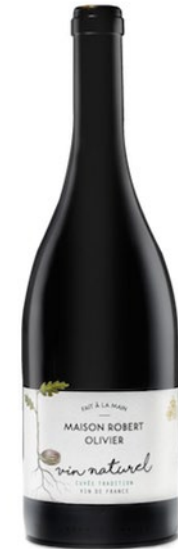
Maison Robert Olivier

Intense aroma of blackberries and cassis with notes of vanilla, chocolate, caramel and roasted aromas. A rich, complex blend of ripe red and black fruits layered with spice, hints of tobacco, wood and leather. Velvety on the palate. Cabernet Sauvignon, Merlot, Petit Verdot, and Malbec.