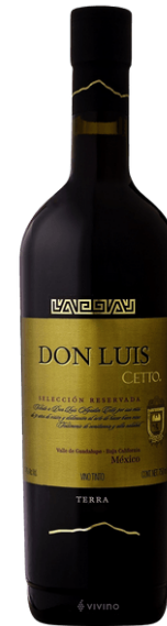
Don Luis Terra

A perfectly balanced Bordeaux blend with an intense ruby color and aromas of dried violet, black cherry, fresh herbs and cocoa powder. Velvety tannins and a lingering finish of dark berries and black licorice round out this award winner.