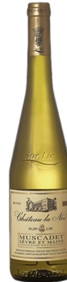
Chateau La Noe Muscadet

A fresh and fruity vibrant wine, with aromas and flavors of green apple, pear and citrus is accompanied by subtle floral notes and a hint of minerality. Crisp, dry and lively acidity on the palate. 100% Chenin Blanc from the Loire Valley. Sustainable.