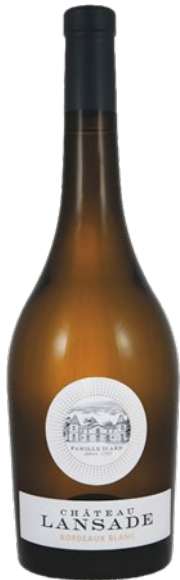
Chateau Lansade Bordeaux Blanc

This softly textured white wine comes from the Icard family holdings in central Entre-deux-Mers France, some which they have owned for centuries. The taste suggests tropical fruits, with tangy acidity to keep everything fresh.