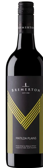
Matilda Plains Red Blend

The cool evenings of the Langhorne Creek region gives this zesty blend of Sauvignon Blanc and Verdelho a natural acidity and finesse. Aromas and a subtle palate of ripe lemon, peach and papaya notes characterize this crisp, refreshing wine. 87 Points, Wine Enthusiast