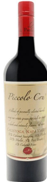
Paoletti Piccolo Cru

A Super Tuscan style Sangiovese, this wine has a deep ruby color, a bouquet of ripe plum, strawberries and sweet baking spices. Light to moderate tannins start mid palate and linger with notes of tobacco spice, dust and dried tobacco leaf on the finish.