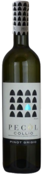
Pecol Collio Pinot Grigio

A light, fruity but dry white wine from the Friuli-Venezia Giulia region of Italy, this Pinot Grigio tastes is fresh green apple, melon and minerality on the palate. Full-bodied with a solid structure and balanced acidity.