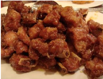
Honey Spare Ribs (Ks1)