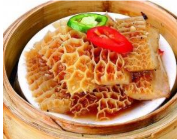
Beef Honeycomb (L)