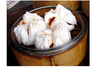
Steamed BBQ Pork Bun (M)