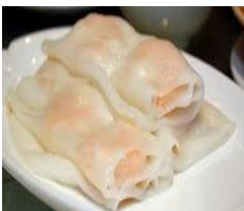
Shrimp Rice Noodle Roll (L)