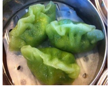
Shrimp w/ Spinach Dumpling (L)