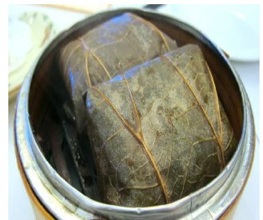
Sticky Rice in Lotus Wrap (L)