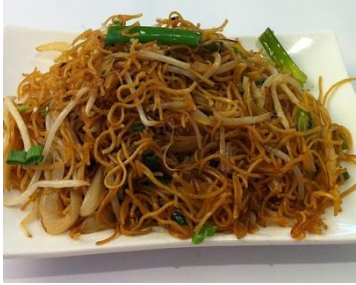
Soy Sauce Chow Mein (Ks1)