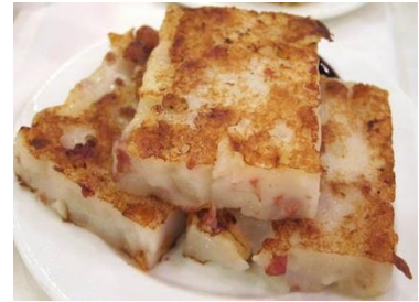
Pan-fried Radish Cake (M)