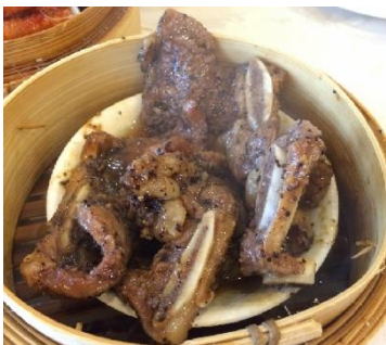
Beef Short Ribs (Sp)