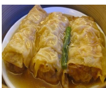
Steamed Bean Curd Roll (L)