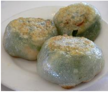
Pan-fried Chive w/ Shrimp (Sp)