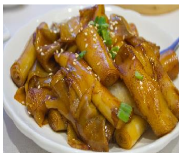
Pan-fried Rice Noodle Roll (Ks1)