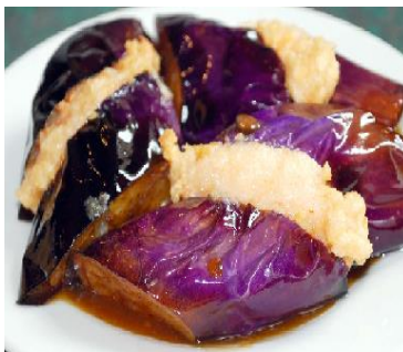
Stuffed Eggplant (Sp)