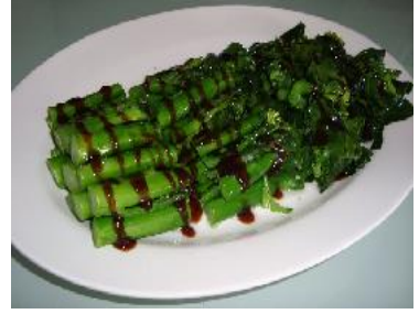
Chinese Broccoli (Ks1)