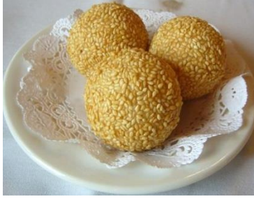
Sesame Balls (S)