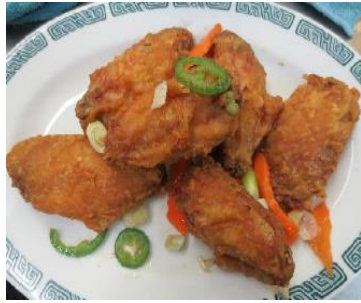
Chicken Wings (Ks1)