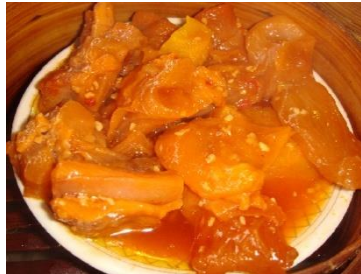
Beef Tendon (Sp)