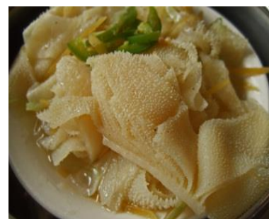
Beef Tripe (L)