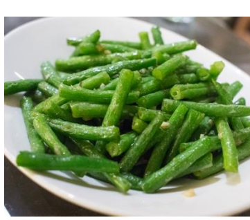
String Beans w/ Garlic Sauce (Ks1)