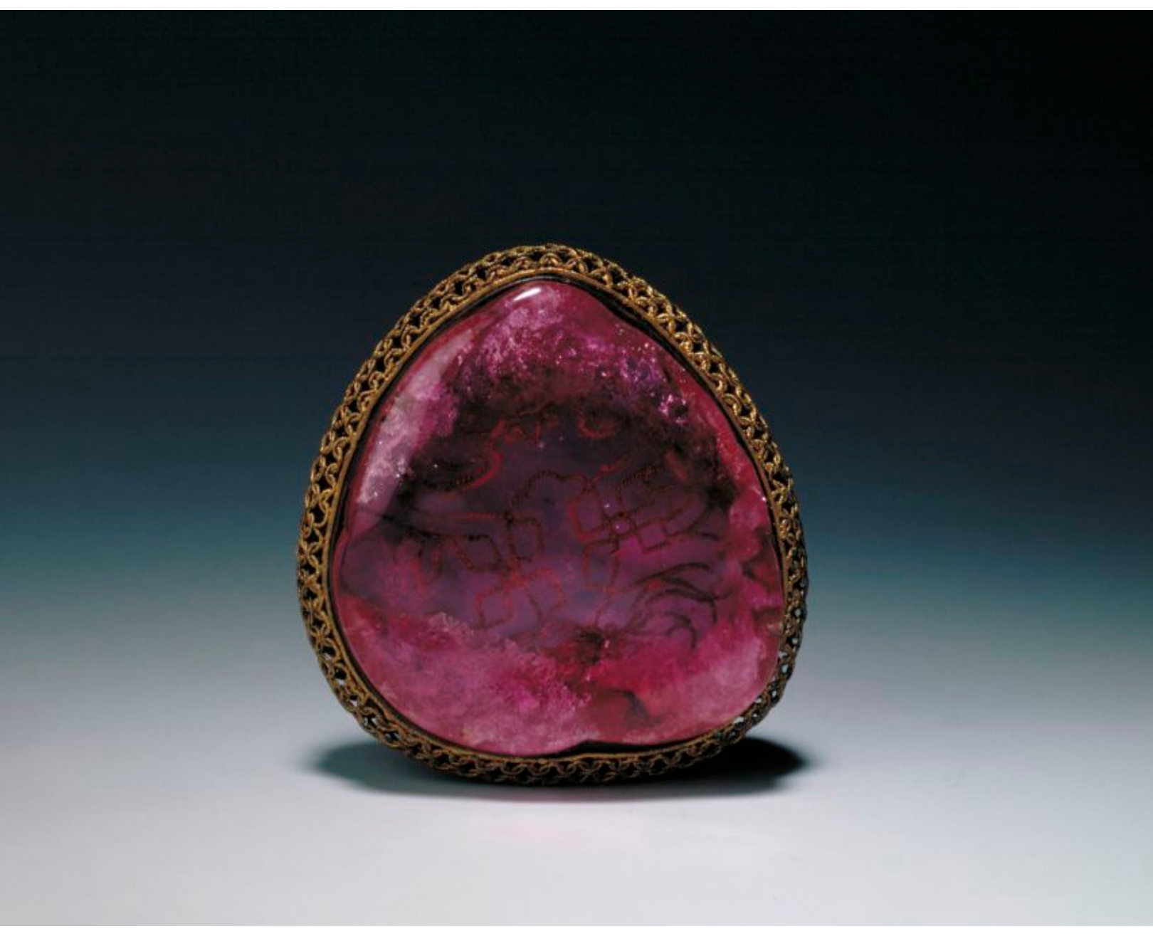
EMPRESS DOWAGER CIXI'S RING

On Display at the Palace Museum, Bejing.