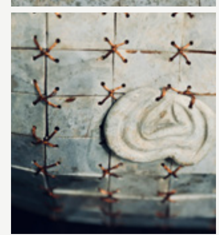
JADE SUIT REPLICA