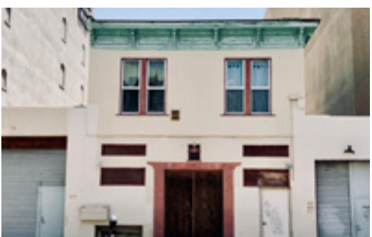
LEFT to RIGHT NORMA QUIN CHAN in her youth NORMA QUIN CHAN today AH QUIN PRODUCE STORE today