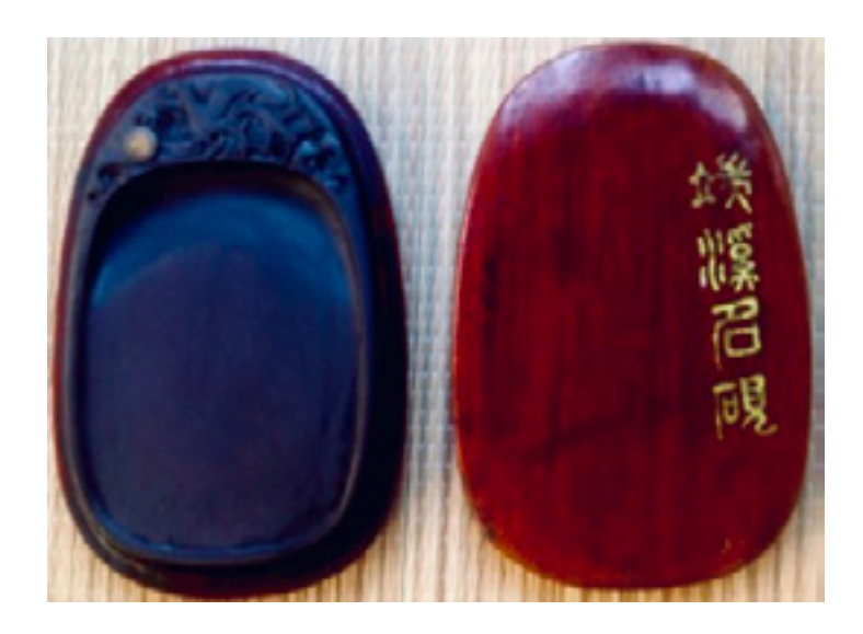
DUAN INKSTONE From Tom Chow's personal collection. The red cover of this inkstone is inscribed in gold, "Famous inkstone of Duan Stream".

This inkstone has a naturally occurring light color spot within the stone at the top left corner. The craftsman skillfully uses it as the Sun with a Phoenix bird next to it. This type of rare natural light spot in the rock is called an "Eye", and is considered a more valuable stone.