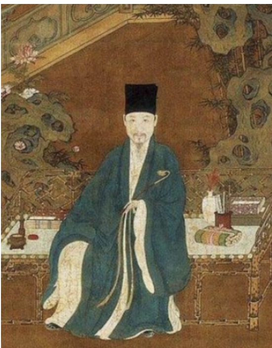
Mi Fu as depicted in a 1107 CE painting by Chao Buzhi 晁補之 (1053-1110)

Mi Fu (1051-1107) was a Chinese painter, poet, and calligrapher who was born during the Song dynasty. He became known for his style of painting misty landscapes. This style would be deemed the "Mi Fu" style, and involved the use of large wet dots of ink applied with a flat brush. His poetry was influenced by the famous Chinese poet, Li Bai and his calligraphy by Jin dynasty master calligrapher Wang Xizhi. Mi Fu is regarded as one of the four greatest calligraphers of the Song dynasty. He was noted to have an eccentric personality, including a mania for cleanliness.