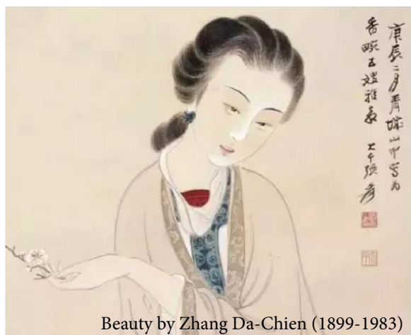
Beauty by Zhang Da-Chien (1899-1983)

He wrote “Li Sao” during his exile, and his death inspired the Dragon Boat Festival. Qu used aromatic plants and the concept of beauty as symbols and metaphors in his poem to express his political ideals and aspirations. His distinctive personality is revealed through the poem. Through calligraphy, paintings, photos and interactive displays, the exhibition aims to illustrate Qu’s writing, connecting it to the festival that commemorates his legacy.