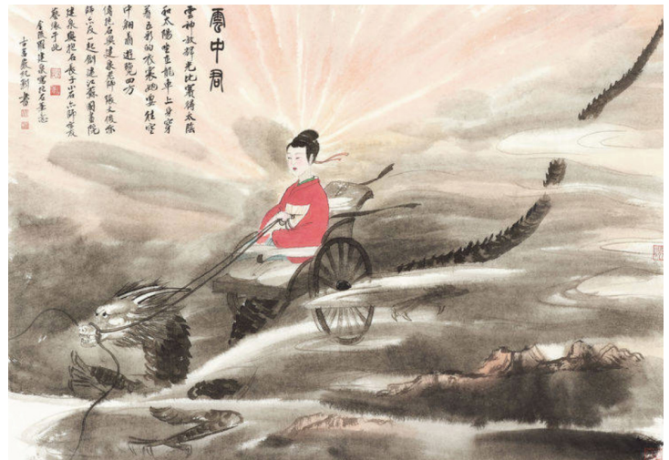
Cloud goddess on the dragon ride by Fu Baoshi (1904-1965)

Qu was less and less convinced that something would work out, given the problematic environment. He lamented that the morals of the world were bad. From his perspective, there was no more hope. Qu asked an oracle to tell his future. The oracle said, “Beauty is always bound to find its mate. This is not the only place where you can find your lady.” The two beauties were the minister and the king. The oracle advised Qu to go far away to find a good king, since no one appreciated him in the Chu state. The images of beauty used in the marriage proposals represented how hard Qu was trying to find a good king and his disappointment with his failures. It’s his way of explaining his desperate situation without ever mentioning the king and the ministers.