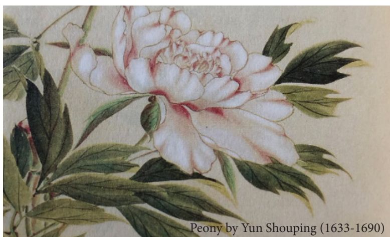
Peony by Yun Shouping (1633-1690)