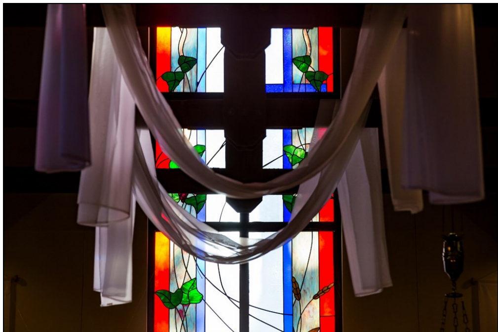
This is how our sanctuary looked on Easter Sunday 2018. In our hearts, it always looks like this – pandemic or not.