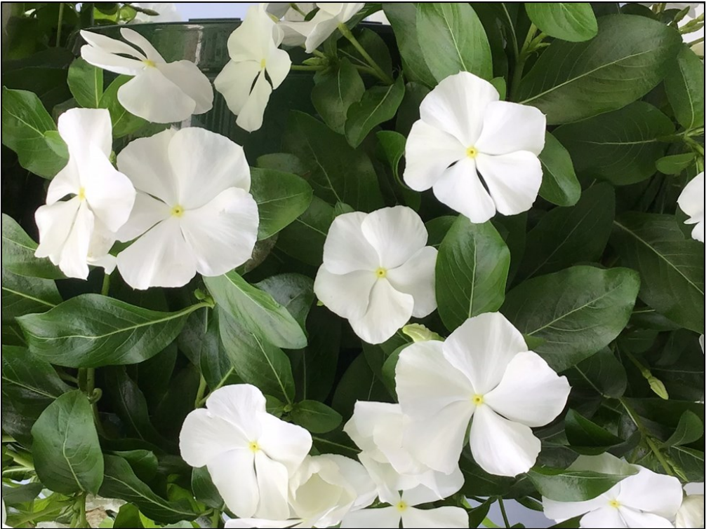
This is the bright, white, cheery sight that greets the members of one St. Stephen household as they step onto their back porch. The vinca's yellow center adds just the right touch, as if our artistic God had picked up a watercolor brush to complete each one.