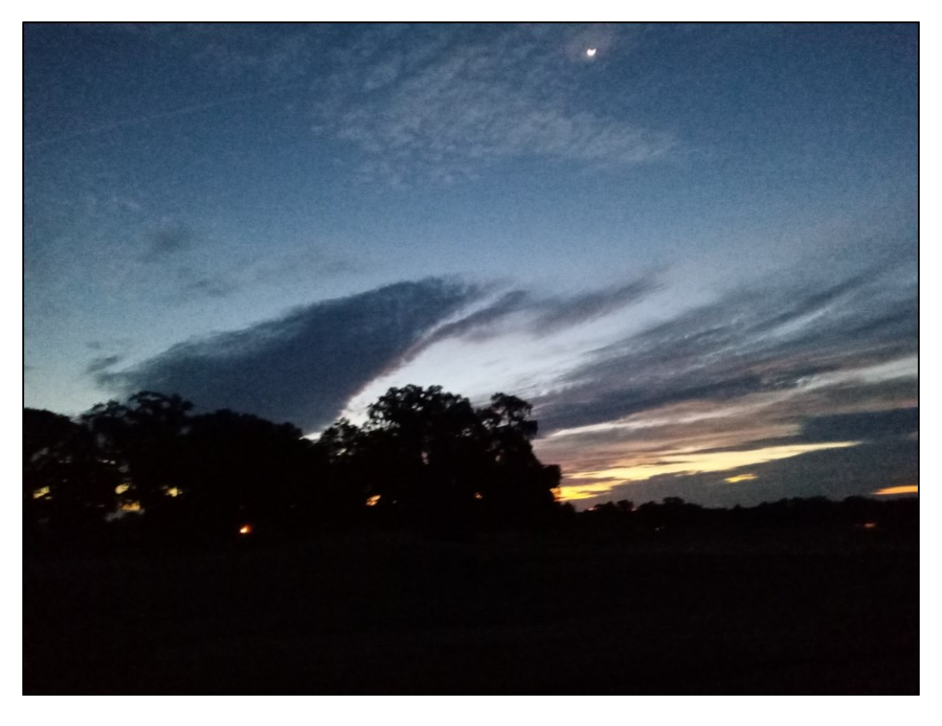
The sun rises Aug. 23, as a slice of the moon high in the sky says goodbye.