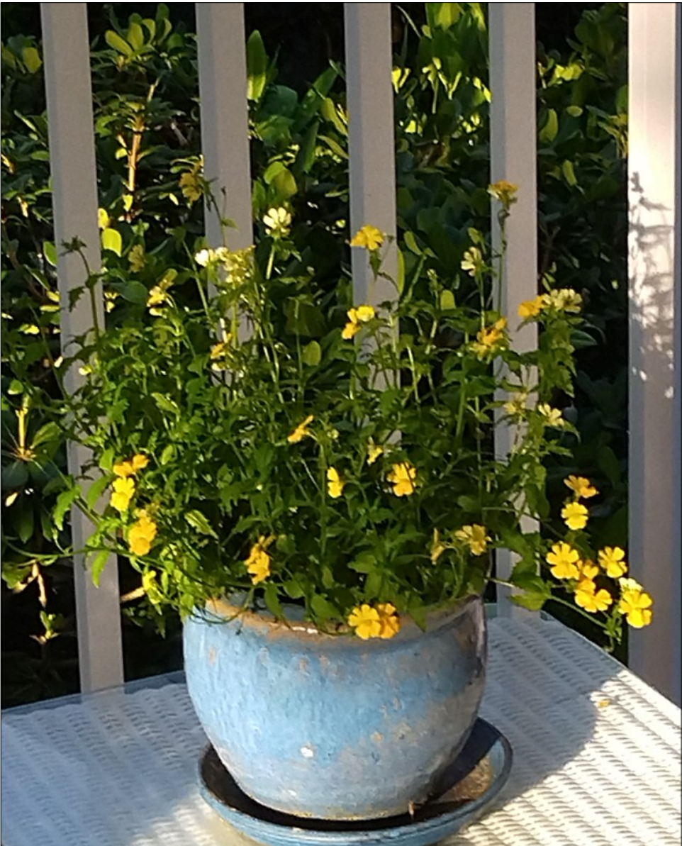
Here’s how the 8 a.m. sun visited a certain Tallahassee Lutheran porch today. This plant might be melampodium. It most definitely is bright yellow, green-leaved, blue-potted, God-sent, lovely.