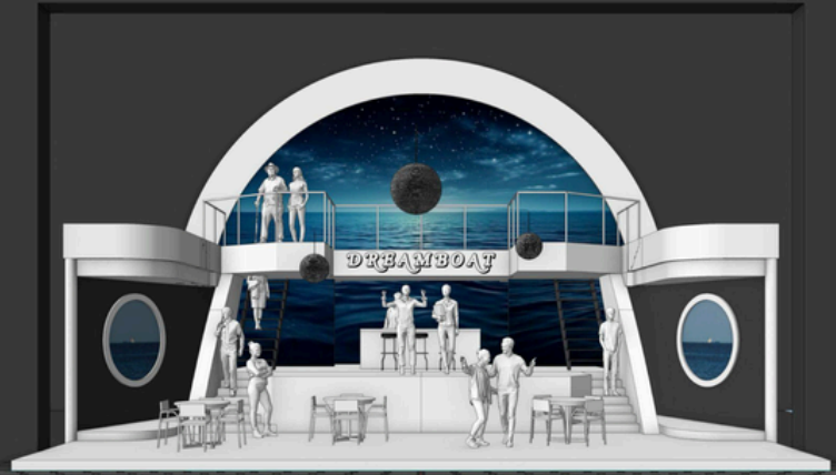
the dreamboat ballroom

jaw studio ny jason ardizzone-west set designer