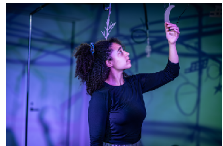
[ ] during our BRIClab Residency