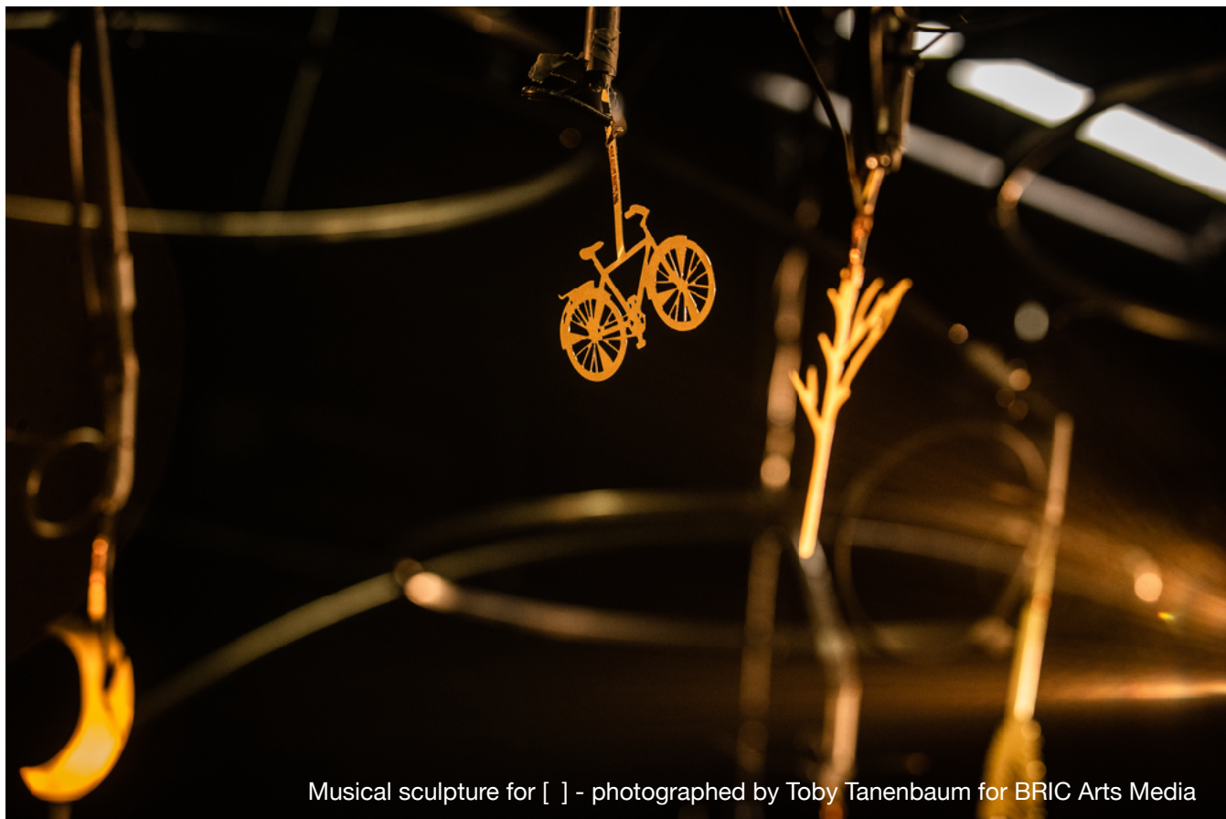
Musical sculpture for