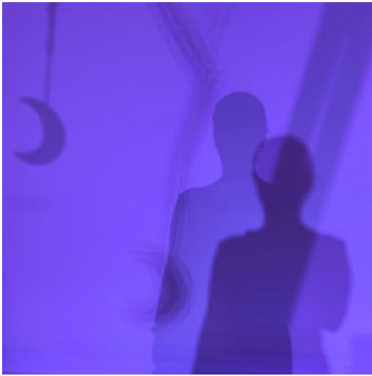
Adrienne explores projection at SLIPPAGE Lab.