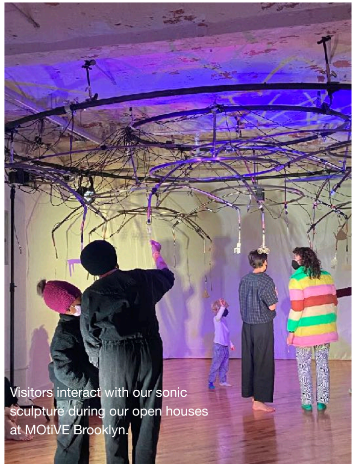
Visitors interact with our sonic sculpture during our open houses at MOtIVE Brooklyn.