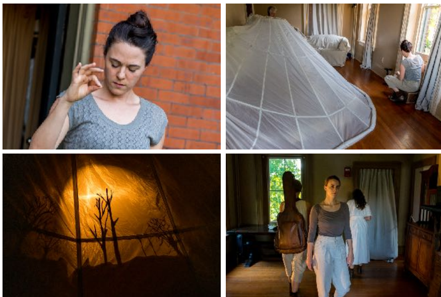
“s o u n d i n g l i n e” at Snug Harbor