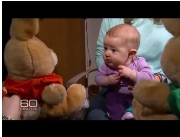
Video (6:23) Infant morality?

Philosophers and psychologists have long believed that babies are born "blank slates," and that it is the role of parents and society to teach babies the difference between right and wrong, good and bad, mean and nice. But, a growing number of researchers now believe differently. Their research argues that babies are in fact born with an innate sense of morality, and, while parents and society can help to develop a belief system in babies, they don't create it. Here is how the