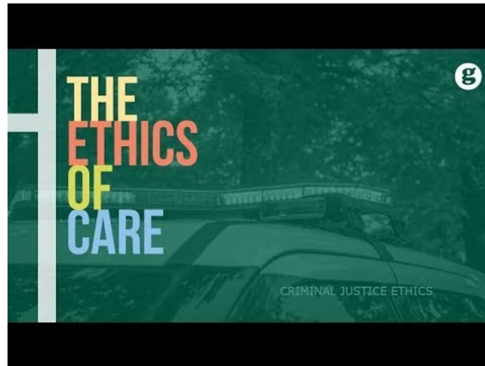
Care Ethics overview (3:01)

Care ethics assumes that there are no two situations requiring moral judgment that are identical. We are immersed in a sea of everyday particularity. Thus, the focus of an Ethics of Care is on understanding the concrete context and particulars of a situation, including who has a stake in the resolution, and a rich description of factual and interpretative information surrounding the situation. The focus is not on determining what abstract, universal principle might apply to the situation. Rather, it is on crafting a set of ethical responses that address the well-being of all those in the relationship or situation and who are affected by the actions. Indeed, an ethic of care takes