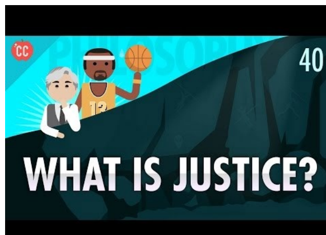
What is Justice? Crash course in philosophy (10:14)

The positivist rationality underlying the Ethics of Justice is a specific type of rationality that serves as the distinguishing feature of the analytic, data-driven modern study of psychology, which has its origins in the rational, scientific method of the physical sciences. This universal impartial methodology—reductionism for the sake of objectivity—forms part of this strict rationality model, which has reigned supreme as the dominant model for science in the western cultural tradition.