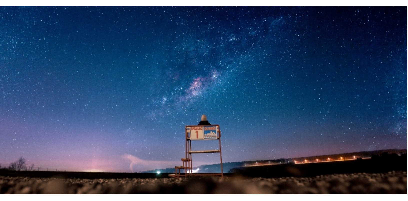
Check out this article for a brief phenomenology of gravity. It illustrates how we should investigate words to question the meaning that is supposedly conveyed by those words. Think you know what gravity is? Read this article: We don't know what gravity is