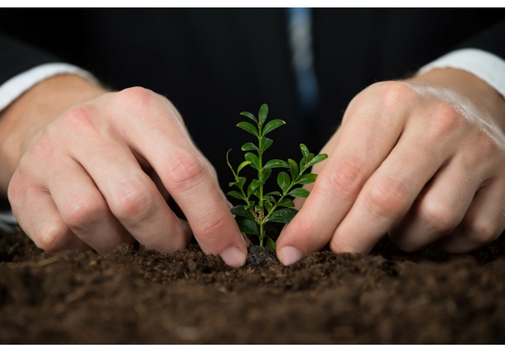
that works more effectively. Your most trusted moral values will stay with you for a lifetime. Yet, the way in which you value your moral values and deploy them in your everyday life will shift and change with experience, knowledge and circumstances.

The path to becoming a moral entrepreneur is the path of personal growth and development. This path leads sometimes to a disruption and reconfiguration of old moral values that were inculcated into your behavior patterns during childhood. These moral values can become calcified and overly rigid and may not be the right fit for you anymore. They can become like old products which have served their purpose but now need to be replaced with something new and different