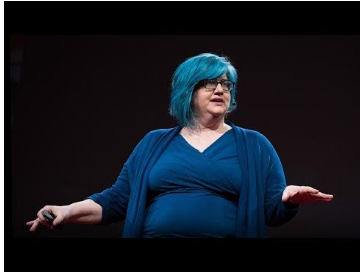
Cathy O'Neil: The era of faith in Big Data must end (13:19)

human hand targeting the data-driven payload toward decision-making about members of unsuspecting groups. Listen to Cathy O’Neils assessment in the following video.