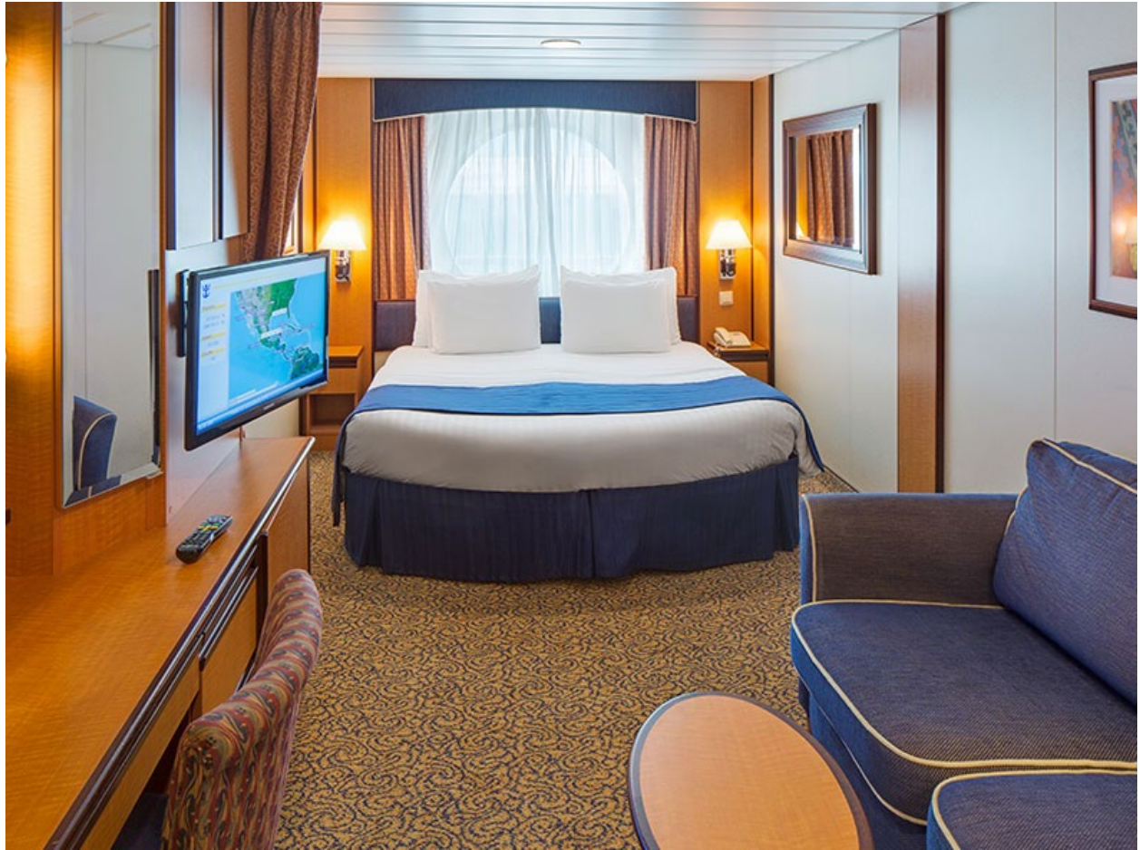
$4,995 per person based on double occupancy of an Oceanview with Private Balcony Stateroom