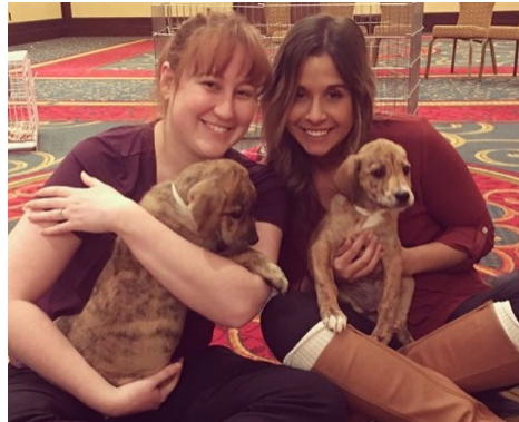
The Marriot Downtown at Key Center hosted a puppy day for their employees featuring some of our pups! The generous employees put together a donation drive for the shelter collecting some of our most needed items. They also donated $1,000 and two puppies found their forever homes at the event!