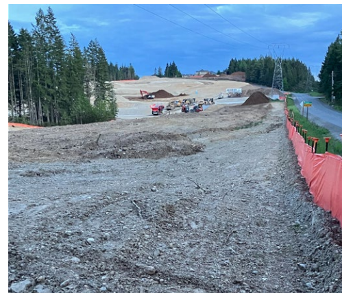
Blue Fern Development is shown making quick work of its 500-lot project south of HP2 on either side of Eldorado.

No, not Atlantic Coast Conference (even if you may be a Florida State or Virginia fan), but rather the Architectural Control Committee of your HOA Board. Promised is prompt review and response to your plans. Please submit relevant details to highpointeiihoa@gmail.com .