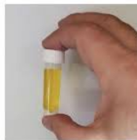
POSITIVE RESULT: Bacteria Detected