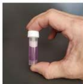
NEGATIVE RESULT: Bacteria NOT Detected

Listed on the next graph are the Water Samples Analysis from Asbestos, Haloacetic Acids and Trihalmethanes. The final results were well below minimum allowed by the EPA.