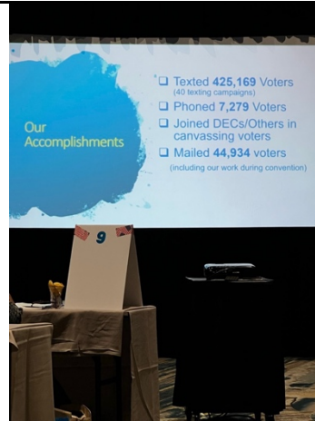
DWCF PAC's Grassroots Team Accomplishments