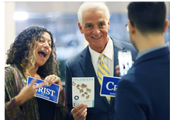
Charlie Crist mingles before the start of the Democratic Women's Clubs of Florida forum for the three major Democratic gubernatorial candidates at the Rosen Centre Hotel in Orlando on Friday, April 29, 2022. Charlie Crist, Nikki Fried and Annette Taddeo all participated in the forum.