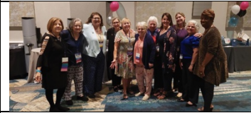
Region 8 Delegation