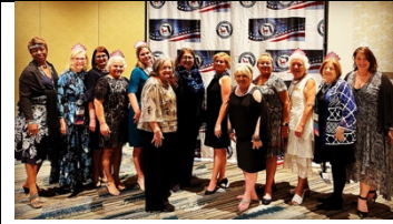
The 'Royalty' of DWCF Region 8 Delegation