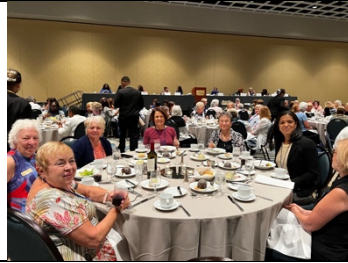
DWCF Convention Lunch