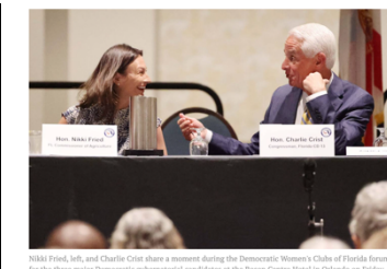
Nikki Fried, left, and Charlie Crist share a moment during the Democratic Women's Clubs of Florida forum for the three major Democratic gubernatorial candidates at the Rosen Centre Hotel in Orlando on Friday, April 29, 2022. Charlie Crist, Nikki Fried and Annette Taddeo all participated in the forum.

*Click on photos for link to the article. Must have an Orlando Sentinel subscription to read the article, unfortunately.