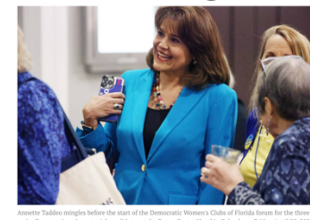
Annette Taddeo mingles before the start of the Democratic Women's Clubs of Florida forum for the three major Democratic gubernatorial candidates at the Rosen Centre Hotel in Orlando on Friday, April 29, 2022. Charlie Crist, Nikki Fried and Annette Taddeo all participated in the forum.