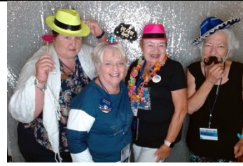
The Groovy DWCF Delegation