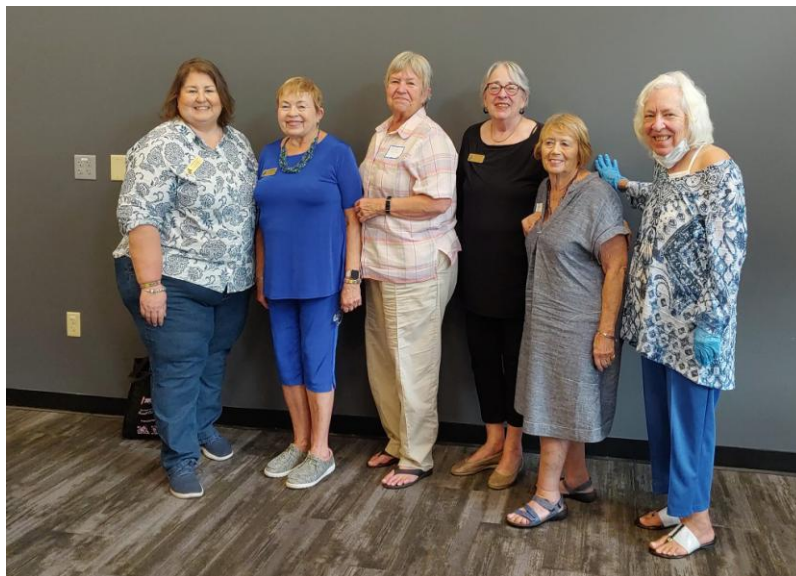
Newly elected Board Members

I look forward to the coming year as we will be meeting together and doing the work that needs to be done in an election year. We must work hard to turn Florida Blue.