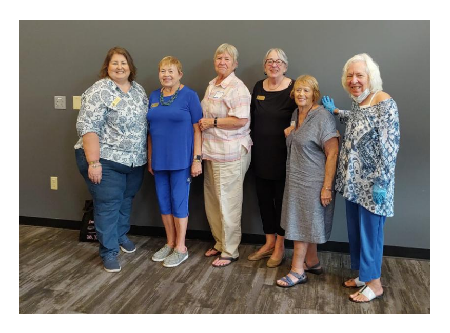
Newly elected Board Members

I look forward to the coming year as we will be meeting together and doing the work that needs to be done in an election year. We must work hard to turn Florida Blue.