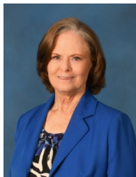
Commissioner Pat Gerard, Incumbent Candidate for Pinellas County Commission District 2.