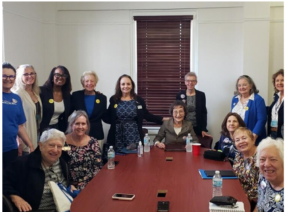
DWCF reps meeting with the new FL Dem Chair, Nikki Fried