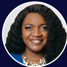
REP. FENTRICE DRISKELL