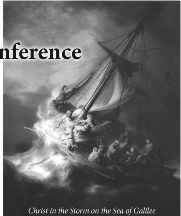
Christ in the Storm on the Sea of Galilee

Fear works and the devil knows it. Today we face storms like the one on the Sea of Galilee. We ask the Lord, as the Apostles did, "Do you not care if we perish?" Christ's reply to them is the same He would give to us: "Why are you afraid? [i.e., cowardly] Have you no faith?" So, in times of crisis, Jesus challenges us not to be cowards but instead to face our fears with confidence, knowing that He has already won the victory over evil.