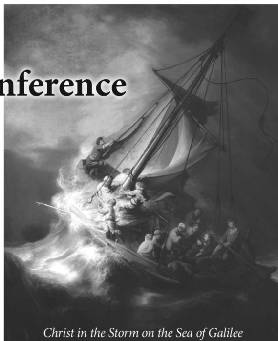
Christ in the Storm on the Sea of Galilee

Fear works and the devil knows it. Today we face storms like the one on the Sea of Galilee. We ask the Lord, as the Apostles did, "Do you not care if we perish?" Christ's reply to them is the same He would give to us: "Why are you afraid? [i.e., cowardly] Have you no faith?" So, in times of crisis, Jesus challenges us not to be cowards but instead to face our fears with confidence, knowing that He has already won the victory over evil.