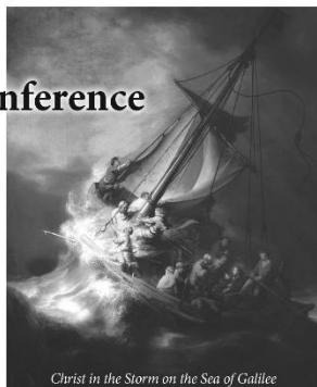
Christ in the Storm on the Sea of Galilee

Fear works and the devil knows it. Today we face storms like the one on the Sea of Galilee. We ask the Lord, as the Apostles did, "Do you not care if we perish?" Christ's reply to them is the same He would give to us: "Why are you afraid? [i.e., cowardly] Have you no faith?" So, in times of crisis, Jesus challenges us not to be cowards but instead to face our fears with confidence, knowing that He has already won the victory over evil.