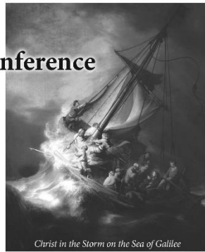
Christ in the Storm on the Sea of Galilee

Fear works and the devil knows it. Today we face storms like the one on the Sea of Galilee. We ask the Lord, as the Apostles did, "Do you not care if we perish?" Christ's reply to them is the same He would give to us: "Why are you afraid? [i.e., cowardly] Have you no faith?" So, in times of crisis, Jesus challenges us not to be cowards but instead to face our fears with confidence, knowing that He has already won the victory over evil.