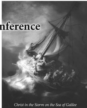
Christ in the Storm on the Sea of Galilee

Fear works and the devil knows it. Today we face storms like the one on the Sea of Galilee. We ask the Lord, as the Apostles did, "Do you not care if we perish?" Christ's reply to them is the same He would give to us: "Why are you afraid? [i.e., cowardly] Have you no faith?" So, in times of crisis, Jesus challenges us not to be cowards but instead to face our fears with confidence, knowing that He has already won the victory over evil.