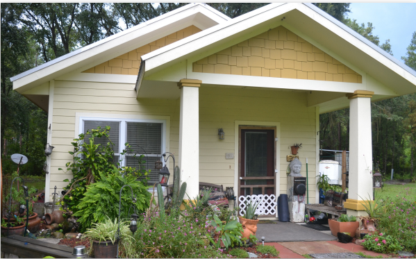
Hope Community camp event!